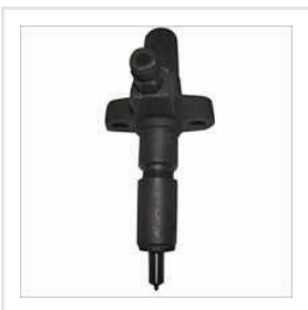
Fuel Injector Andoria S 320, S 321