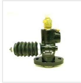
RSC 9 410 031 021 (9410031021) Injection