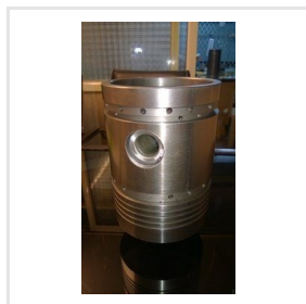
Deutz Piston Ring Set BF4L913, BF6L913 Diesel