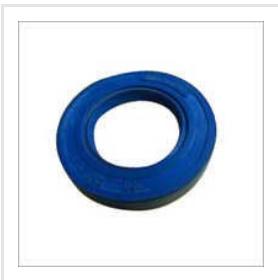
Automotive Oil Seal