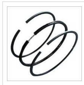
Piston Ring Springs