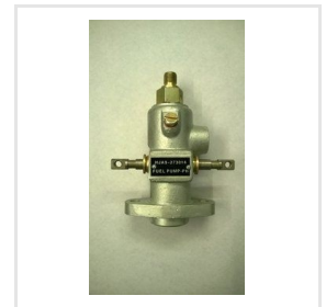
RSC, Petter Fuel Pump FA0AB080C0770, Petter