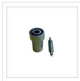
Diesel Injection Nozzles DN 0 SD 265 For