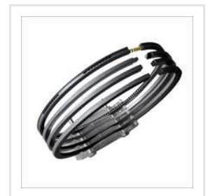
Compressor Piston Rings