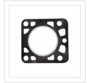
Lister Cylinder Head Gasket, And 6/1 To 8/1