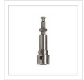
Injection Plunger 1 418 325 096 For