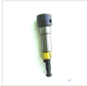
PUMP ELEMENT 11-108FB For Lister TS 11/108