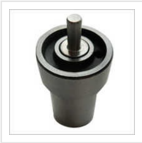
Andoria Injector Nozzle S320 S321