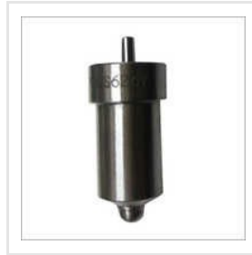
Nozzle BDL110S6133, 6267 , 5611650 Massey