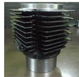
AUTOMOTIVE ENGINE PARTS