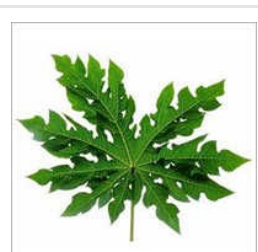
Papaya Dry Leaves