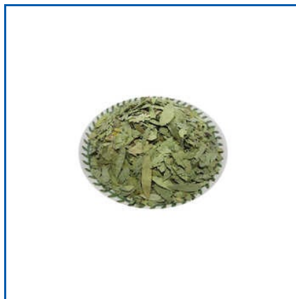
NATURAL SENNA LEAVES