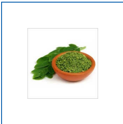
MORINGA DRY LEAVES

20180321, Bay Leaf, Black Pepper, Black Tea Powder, Brahmi Leaves, Caraway Seeds, Coco Pith, Corn Starch Flour, Cumin Seeds, Curd Dry Chili, Curry Leaves, Dried Hibiscus Flower, Dry Amla Fruits, Dry Ginger, Dry Gymnema Sylvestre Leaves, etc.