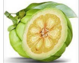
Garcinia Cambogia Extract