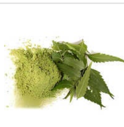
Neem Leaves And Neem Powder