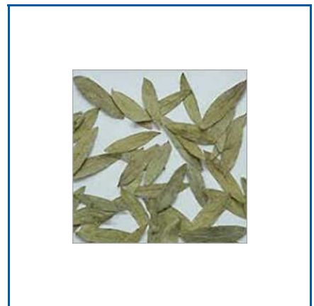
SENNA DRY LEAVES