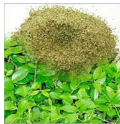
Gymnema Sylvestre Extract