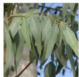
Eucalyptus Dry Leaves