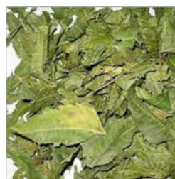
Dry Gymnema Sylvestre Leaves