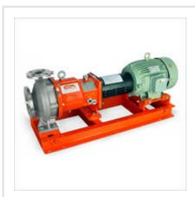
SS Magnetic Drive Chemical Process