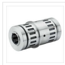
Magnetic Drive Pump Cartridge Bearing