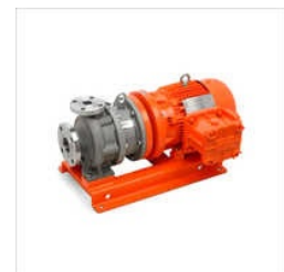
SEALLESS MAGNETIC DRIVE CHEMICAL PROCESS CLOSE COUPLED PUMP