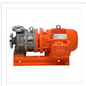
SS Magnetic Drive Chemical Process