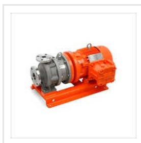
Sealless Magnetic Drive Chemical