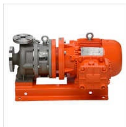
SS MAGNETIC DRIVE CHEMICAL PROCESS CLOSE COUPLED PUMP