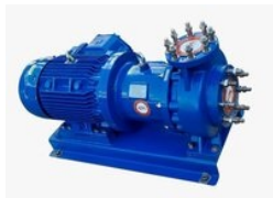
PFA LINED SEALLESS MAGNETIC DRIVE CHEMICAL PROCESS PUMP

CZB Series Magnetic Drive Chemical Process Pumps, Magnetic Drive Pump Cartridge Bearing (Bearing Bush), Magnetic Drive Pump Impeller, PFA Lined Magnetic Drive Pump, PFA Lined Sealless Magnetic Drive Chemical Process Pump, PVDF Lined Magnetic Drive Pump, SS Magnetic Drive Chemical Process Close Coupled Pump, SS Magnetic Drive Chemical Process Frame Mounted Pump, Sealless Magnetic Drive Chemical Process Close Coupled Pump, etc.