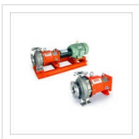
CZB Series Magnetic Drive Chemical