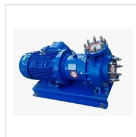
PVDF Lined Magnetic Drive Pump