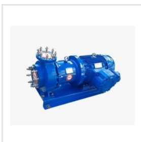
PFA Lined Magnetic Drive Pump