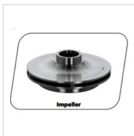
Magnetic Drive Pump Impeller