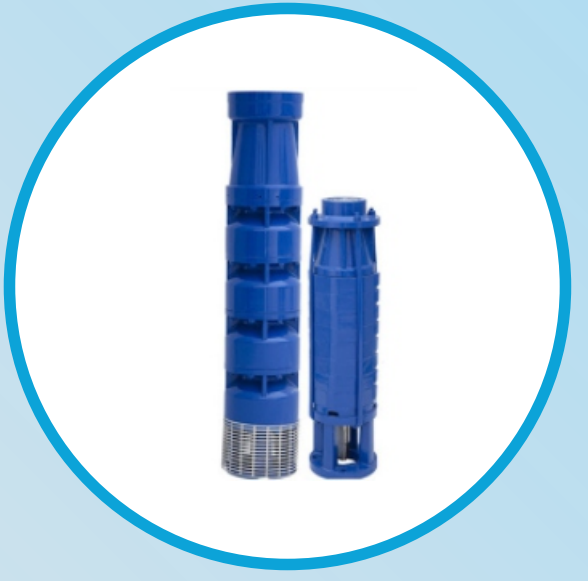
Cast Iron Submersible Pumps