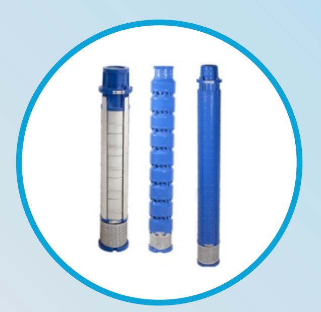
Submersible Borewell Pump