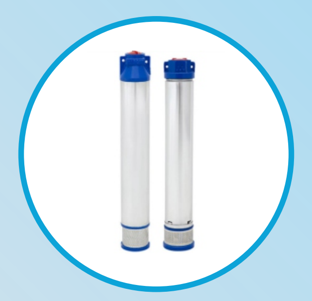
Deep Well Submersible Pumps