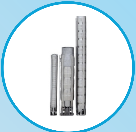
Stainless Steel Borewell Submersible Pumps