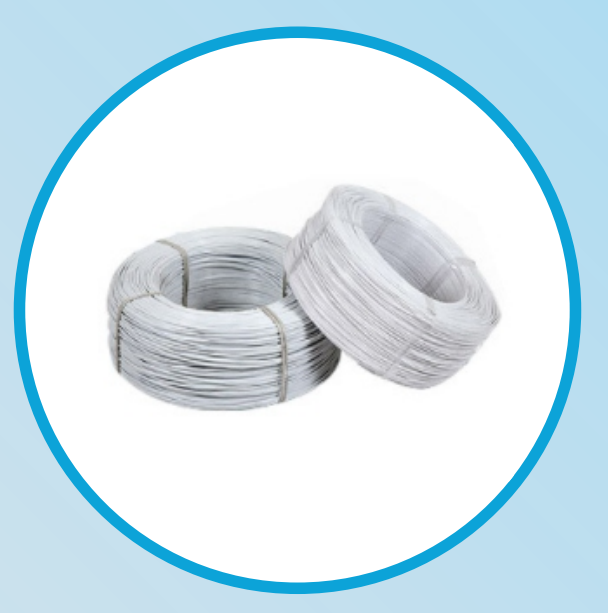
Submersible Winding Wire