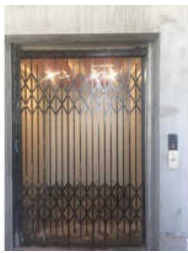
2.5 Ton MS Hydraulic Goods Lift