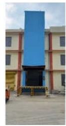
2 Ton Industrial Goods Elevator