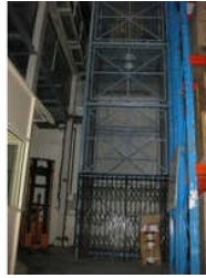
1.2 MS Ton Industrial Goods Lift