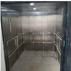
1.8 Ton SS Industrial Goods Lift