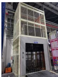
1 Ton MS Hydraulic Goods Lift