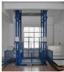
3 Ton MS Factory Goods Lift