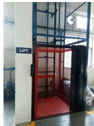
0.5 Ton MS Industrial Goods Elevator