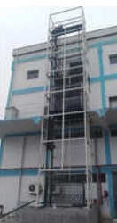
4 Ton MS Outer Goods Lift