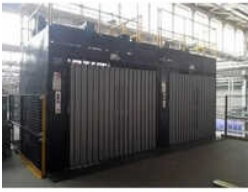
1 Ton MS Freight Goods Elevator