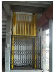
1.5 Ton MS Industrial Lift