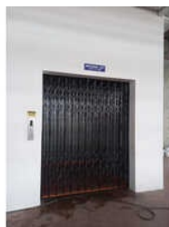
1 Ton MS Industrial Goods Lift