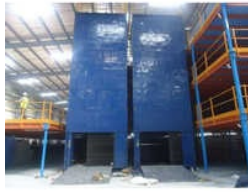
4.5 Ton MS Structure Lift