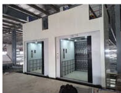
2 Ton MS Cage Goods Elevators