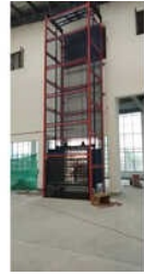
2 Ton MS Industrial Goods Lift