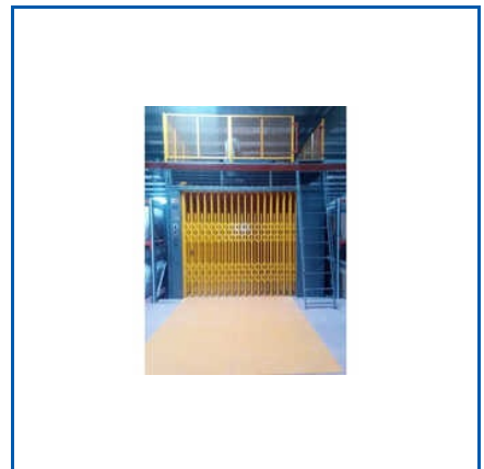
4 TON IRON INDUSTRIAL GOODS LIFT