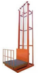
1 Ton MS Hydraulic Industrial Goods Lift