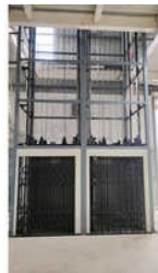
0.5 Ton MS Indoor Goods Lift