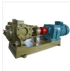
INDUSTRIAL BITUMEN GEAR PUMP