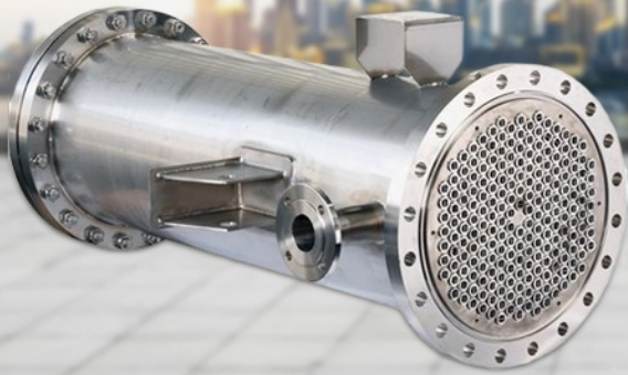
SS Heat Exchanger