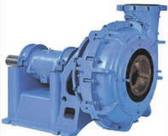
Industrial Slurry Pump