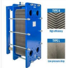
Industrial Plate Heat Exchanger