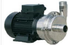
Chemical Process Pump