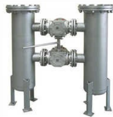
Industrial Duplex Strainer