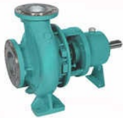
Thermic Fluid Centrifugal Pump