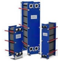
Plate Heat Exchanger