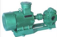
High Pressure Lube Oil Pump