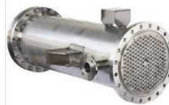
Industrial Tube Heat Exchanger