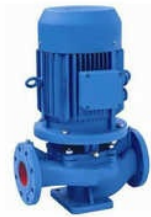
Vertical Centrifugal Pump