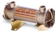
Carbon Steel Heat Exchanger