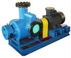
Industrial Fuel Oil Pump