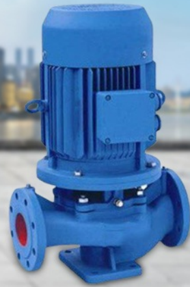
Vertical Centrifugal Pump

Carbon Steel Heat Exchanger, Chemical Process Pump, Flange Gear Pump, Foot Gear Pump, High Pressure Lube Oil Pump, High Pressure Pump, Industrial Bitumen Gear Pump, Industrial Duplex Strainer, Industrial Fuel Oil Pump, Industrial Lube Oil Pump, Industrial Plate Heat Exchanger, Industrial Slurry Pump, Industrial Tube Heat Exchanger, Plate Heat Exchanger, Single Screw Pump, etc.