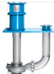
Vertical Chemical Pump