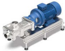
Twin Screw Pump