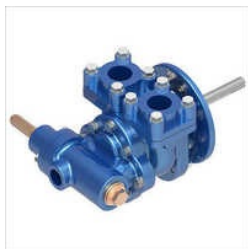
FLANGE GEAR PUMP

Carbon Steel Heat Exchanger, Chemical Process Pump, Flange Gear Pump, Foot Gear Pump, High Pressure Lube Oil Pump, High Pressure Pump, Industrial Bitumen Gear Pump, Industrial Duplex Strainer, Industrial Fuel Oil Pump, Industrial Lube Oil Pump, Industrial Plate Heat Exchanger, Industrial Slurry Pump, Industrial Tube Heat Exchanger, Plate Heat Exchanger, Single Screw Pump, etc.