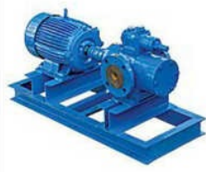
Industrial Lube Oil Pump