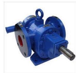
FOOT GEAR PUMP