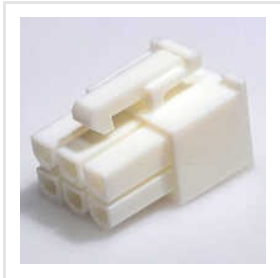
4.2mm Receptacle Housing Nylon 4