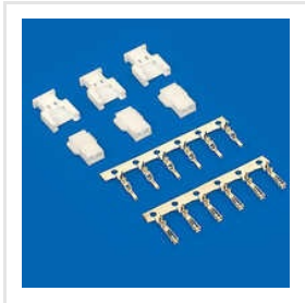
Electric Molex Connector