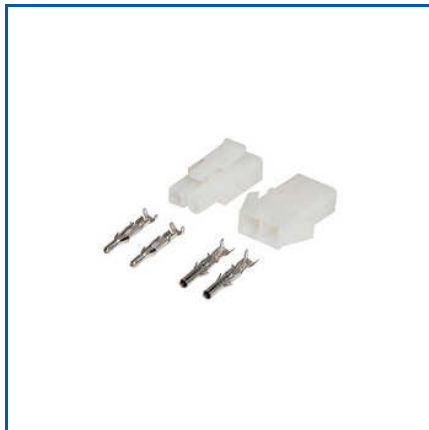
DC POWER CONNECTORS