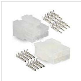
Molex 12 Circuit Connector