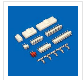
Molex Alternative Connector