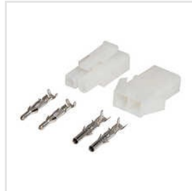
DC Power Connectors