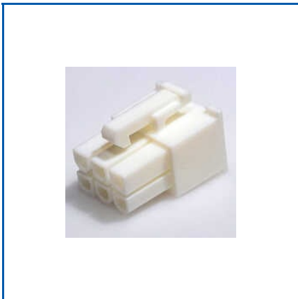
4.2MM RECEPTACLE HOUSING NYLON 4 POSITIONS DUAL ROW CONNECTOR

2.5mm Pitch Connector, 4-Circuits Molex Connector Lot 3 Matched Sets, 4.2mm Receptacle Housing Nylon 4 Positions Dual Row Connector, DC Power Connectors, Electric Molex Connector, Molex 12 Circuit Connector, Molex 8-Pin Black Connector, Molex Alternative Connector, etc.