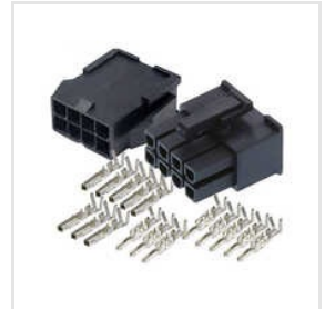
Molex 8-Pin Black Connector