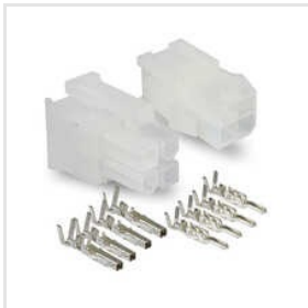
4-Circuits Molex Connector Lot 3