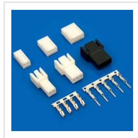
2.5mm Pitch Connector