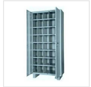
Pigeon Hole Storage Cabinet