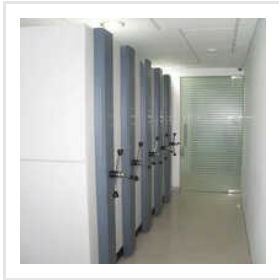
Mechanical Mobile Compactor System