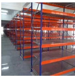
LONG SPAN WAREHOUSE SHELVING RACK

12 Door Locker, 12 Industrial Lockers, 18 Door Locker, 18 Industrial Lockers, 18 Locker Cupboard, 18 Units Cabinet Lockers, 2 Tier Rack with Mezzanine, 24 Industrial Lockers, 24 Locker Cupboard, 6 Industrial Lockers, 6 Locker Cupboard, 8 Industrial Lockers, Book Case Cupboards, Bookcase Unit with 4 compartments, Bulk Storage Racks, etc.