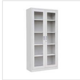
MS Office Storage Cabinet