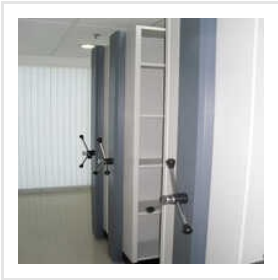
CRCA Steel Mobile Storage Compactor