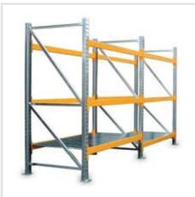
Long Span Shelving Rack