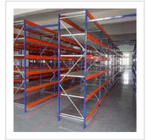
Paint Coated Long Span Rack