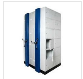
Mobile Storage Unit