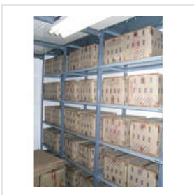
Mild Steel Shelving Storage Rack