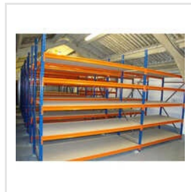
8 Feet Long Span Shelving Rack