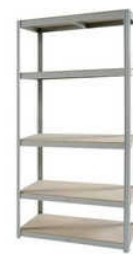
SUPERMARKET SHELVING RACK