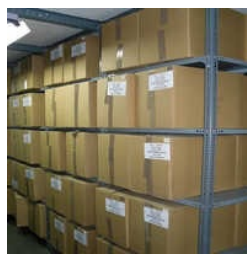
COLOR COATED STORAGE SHELVING RACK