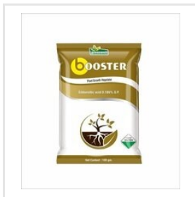
Gibberelic Acid 0.186 SP