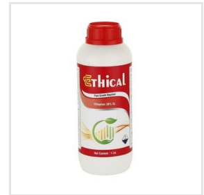
Ethephone 39 SI