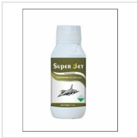
Tricentanol 0.05 Ec