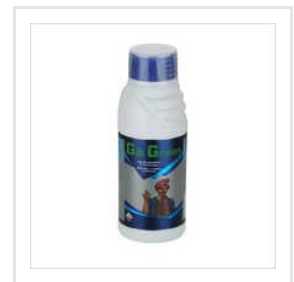
Gibberlic Acid 0.001% L