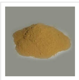
Amino Acid Powder