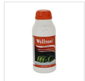
Sodium Nitro Phenolate 0.3 SL