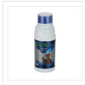
Gibgreen Plant Growth Promoter