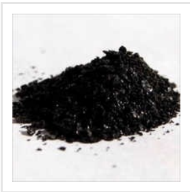
Humic Acid Flakes