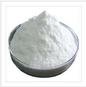
NATCA Plant Growth Promoters