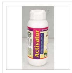
Nitrobenzene 35 %