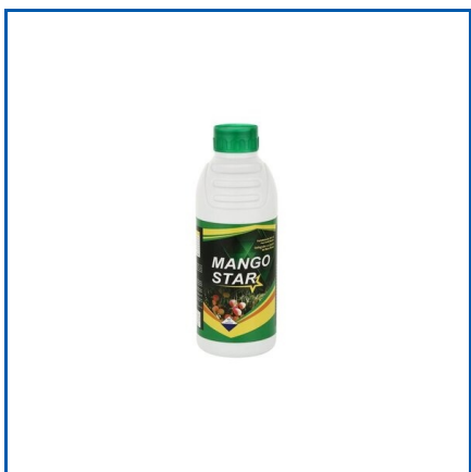
PACLOBUTRAZOL 23 SC