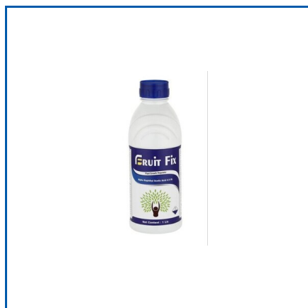
ALPHA NAPHTHYL ACETIC ACID 4.5 SL