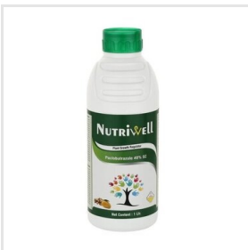
Paclobutrazol 40 Sc