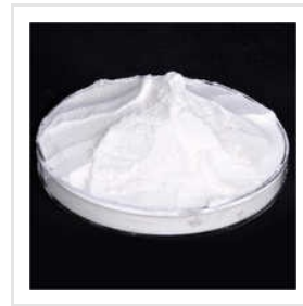
Da 6 Plant Growth Promoter