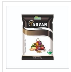
Triacontanol Gr 0.05