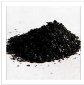
Humic Acid Flakes