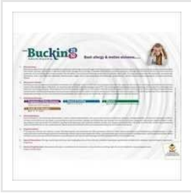
Buckin - 25-50 B