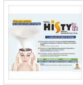
Histy - 8-16