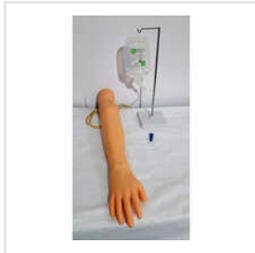
Multifunctional Iv Training Arm Injections