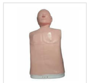
CPR Training Manikins