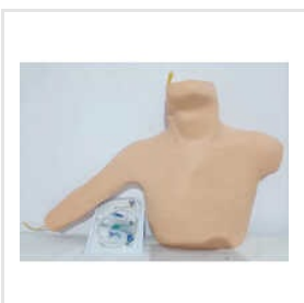
Central Venous Catheterization