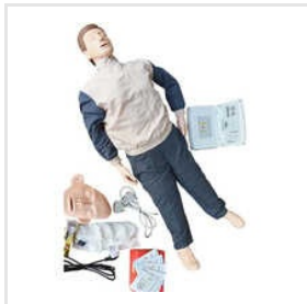
Cpr Full Body With Monitor And Printer