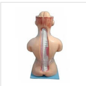
Plastic Human Torso