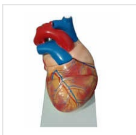
Plastic Human Heart Models