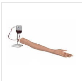
Iv Arm Injection Model