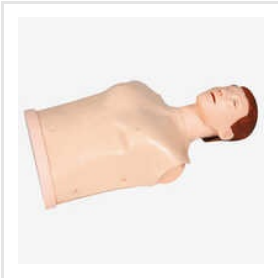
CPR Half Body With Indicators