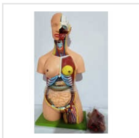
Human Torso Model