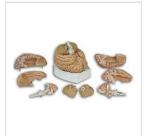
Skull Model With 8 Parts Brain