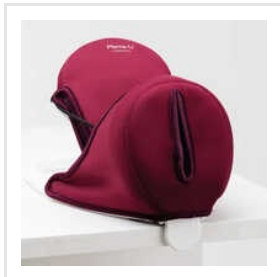
Laerdal Mama U Postpartum Uterus