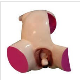
Birth Demonstration Model Course Of