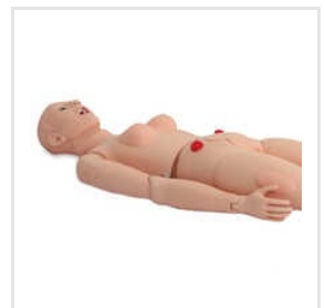
Advance Unisex Multi Function Manikin