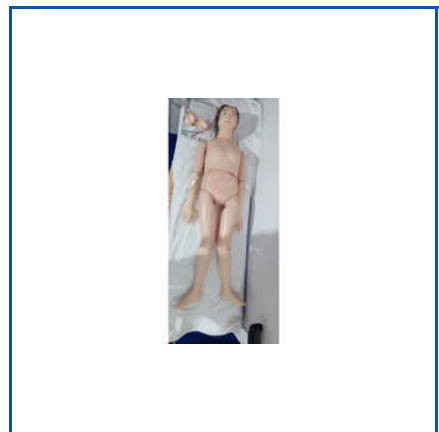
MULTI FUNCTIONAL FEMALE MANIKIN