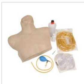
Central Venous Catheterization