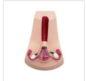
Intra Uterine Device Insertion Model