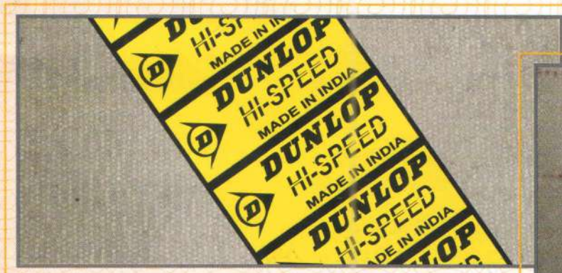
DUNLOP HI-SPEED (31-OZ)

FORT And HIGH-SPEED Two Types Are Made From Hard Duck Confirming To Bis: 1370 - 1993. (Specification). The Square Edges Of Transmission Belts Are Treated With Special Quoting To Prevent Ingress Of Moisture And To Resist Edge Wear. Transmission Belts Are Available In Square Edge.