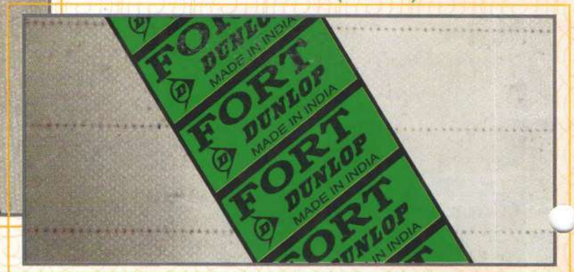
DUNLOP FORT (34-OZ)