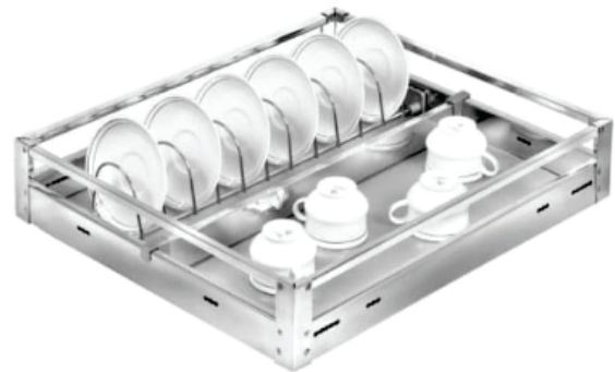
Cup & Saucer Basket

Width (in inches) : 12 | 15 | 17 | 19 | 21 | 24 Depth (in inches) : 16 | 20 Height (in inches) : 8