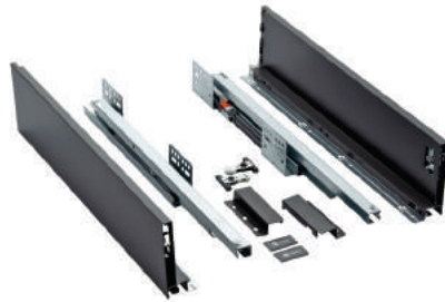
Slim Box Height : 6 inch