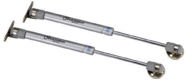
Gas Spring / Shocker