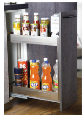
Satin Bottle Pullout 2 shelf