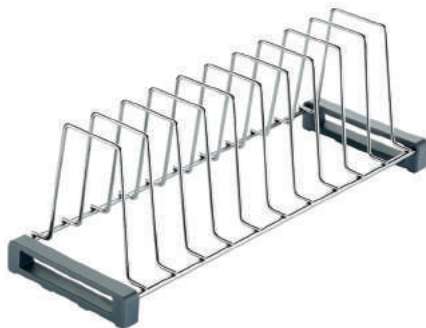
Plate / Thali Insert

Width (in inches) : 12 | 15 | 17 | 19 | 21 | 24 Depth (in inches) : 16 | 20 Height (in inches) : 4