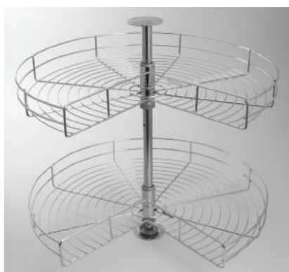
Carousel ¾ Round 270°

Dia Size (in inches) : 22 | 24 | 26 | 28 | 30