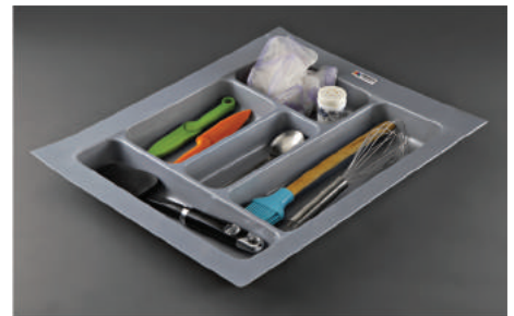
PVC Cutlery (Insert)