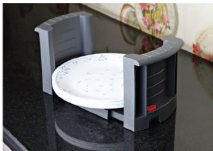
PVC Dish Holder (Insert)