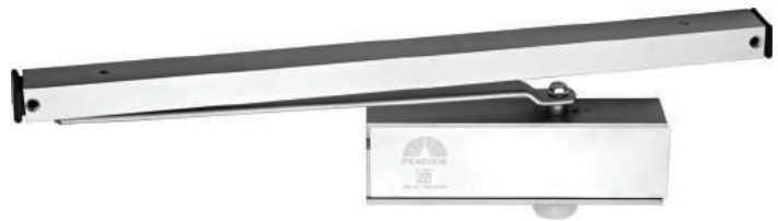
Door Closer Pelmet Arm - 100 Kg.