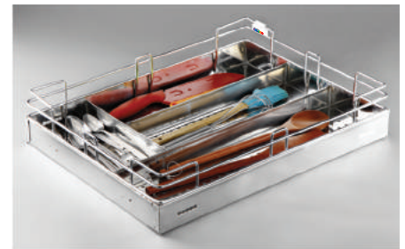
Perforated Cutlery Basket

Width (in inches) : 12 | 15 | 17 | 19 | 21 | 24 Depth (in inches) : 16 | 20 Height (in inches) : 12