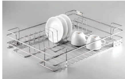
Cup & Saucer Basket

Width (in inches) : 12 | 15 | 17 | 19 | 21 | 24 Depth (in inches) : 16 | 20 Height (in inches) : 4 | 6 | 8