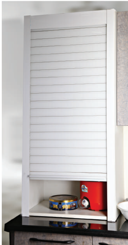
Rolling Shutter Size : 600mm(w) x 1320(h)