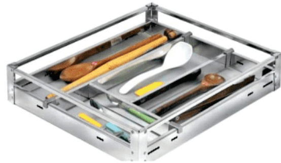
Pipe Cutlery Basket

Width (in inches) : 9 | 12 | 15 | 17 | 19 | 21 | 24 Depth (in inches) : 16 | 20 Height (in inches) : 4 | 6 | 8