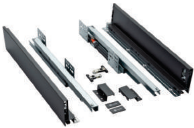
Slim Box Height : 4 inch