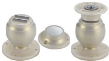
Door Magnetic Holder