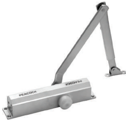
Door Closer - Slim 80 Kg.