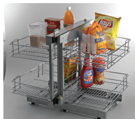
Universal Magic Corner

Dia Size (in inches) : 22 | 24 | 26 | 28 | 30