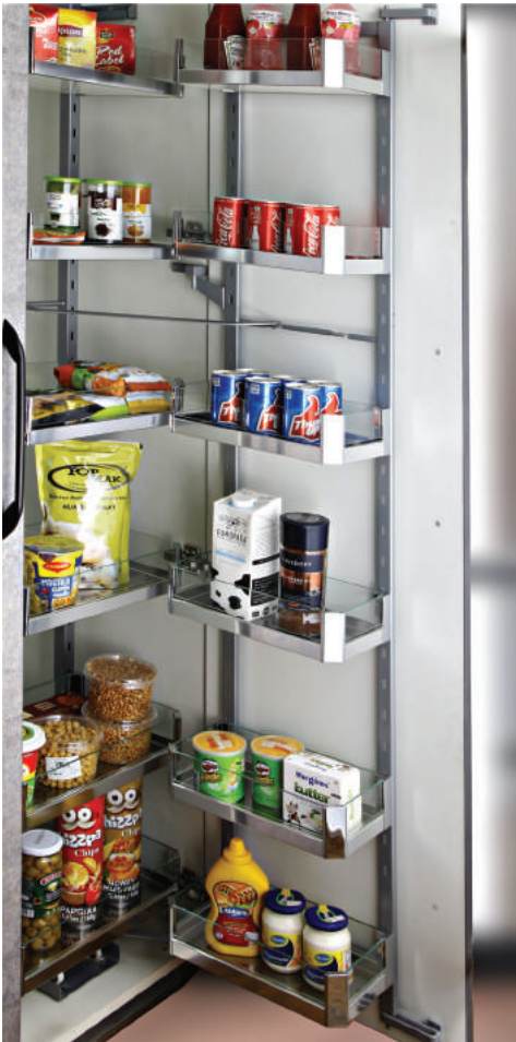
Glass Pantry Unit (6 Layer)