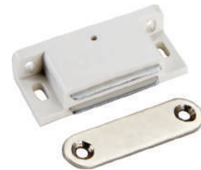
M-3 Magnetic Catcher