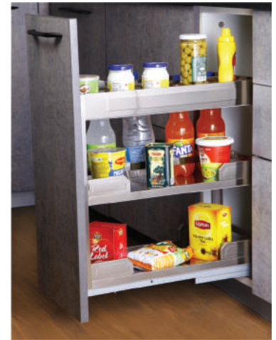
Satin Bottle Pullout 3 shelf