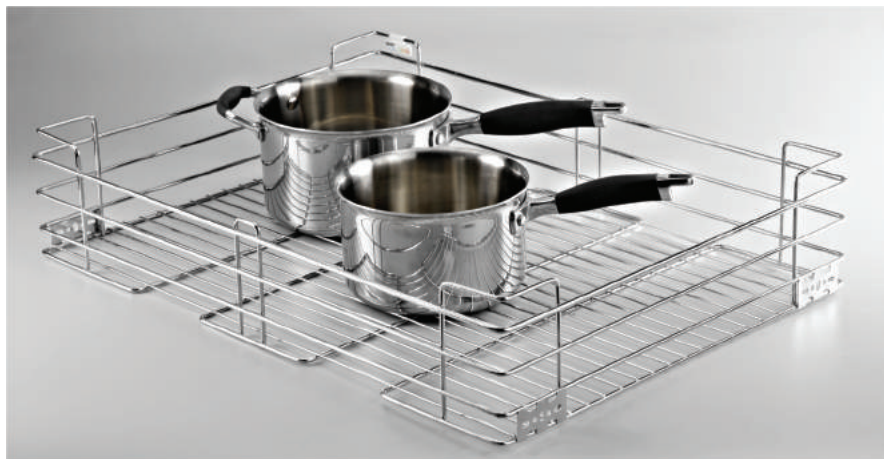
Large Utensils Basket