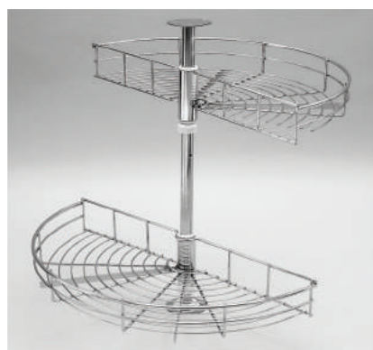
Carousel ½ Round 180°