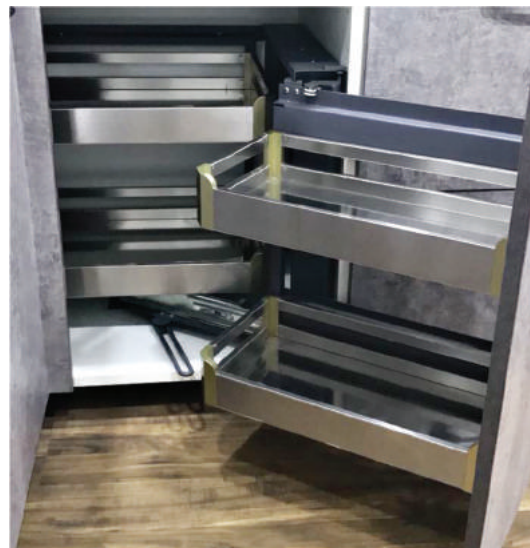
Magic Corner Satin (Left / Right)