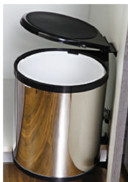
Auto Lid Bin