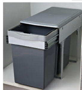
Double Dust Bin