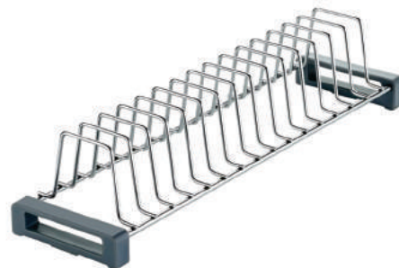
Cup & Saucer Insert