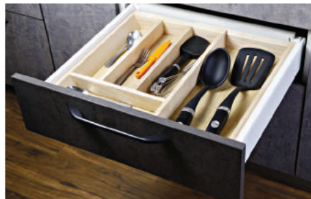
Wooden Adjustable Cutlery (Insert)