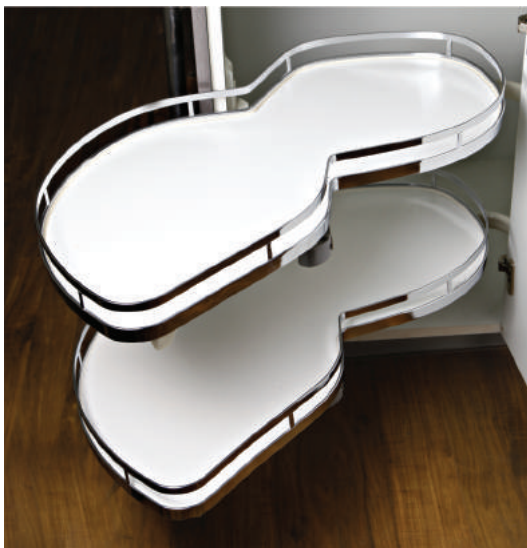
Soft Close Swift Corner (Left / Right)