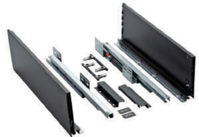
Slim Box Height : 8 inch