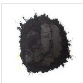
Cast Iron Powder