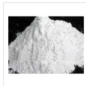
White Chalk Powder