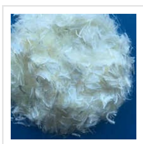
Polyvinyl Pva Fiber