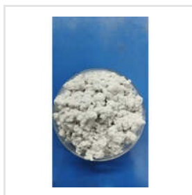
White Paper Pulp