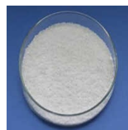
BORAX PENTA PRODUCTS