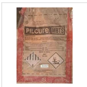
Mbts Rubber Accelerator