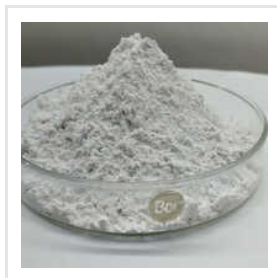
Grey Barium Sulphate