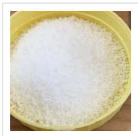
White Perafin Wax