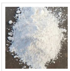
Barium Sulphate Powder