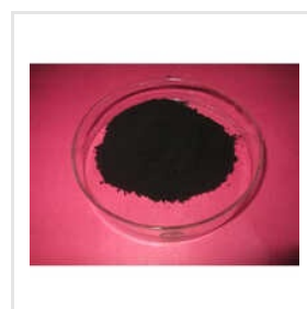
Carbon N Powder