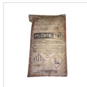
Pilcure Tmt Accelerator