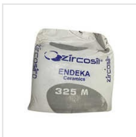
Edika Zircon Powder