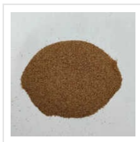
Brown Zircon Sand