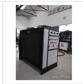
RO Water Chiller