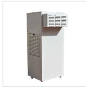
Outdoor Panel AC