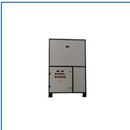
AIR COOLED GLYCOL CHILLER

1000 Watt Panel AC, 1000W Panel Air Conditioner, 1500 Watt Panel AC, 1500W Panel Air Conditioner, 2000W Panel Air Conditioner, 2700 Watt Panel AC, 2700W Panel Air Conditioner, 300 Watt Panel AC, 300 Watt Water Chiller, 300W Panel Air Conditioner, 34Ltr Air Cooled Water Chiller, 3500W Panel Air Conditioner, 42Ltr Air Cooled Water Chiller, 5 Ton Automatic Water Chiller, 500 Watt Panel AC, etc.