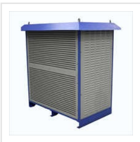
Oil Cooled Chiller