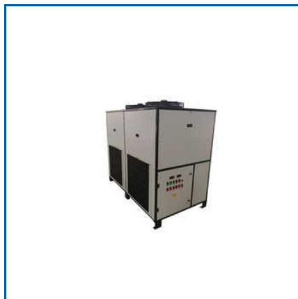
AIR COOLED BRINE CHILLER