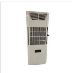
1000 Watt Panel AC