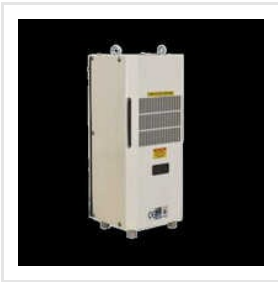
TRP PAC 300W Wall Mount Panel Air