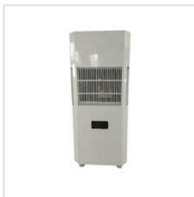
300 Watt Panel AC