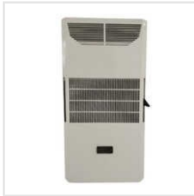
1500 Watt Panel AC