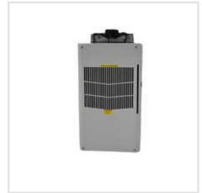
2700 Watt Panel AC