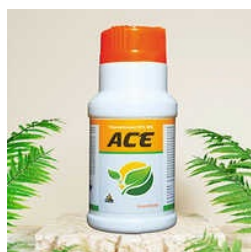
Thiamethoxam 25% WG Insecticide