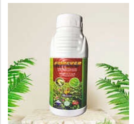
500ml Diafenthiuron 47.8% W-W SC Broad