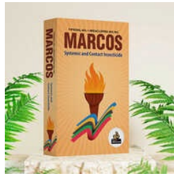
Fipronil 40% + Imidacloprid 40% WG