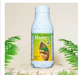
Fipronil 5% SC Systemic And Contant