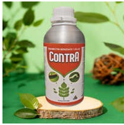
Emamectin Benzoate 1.9% EC Insecticides