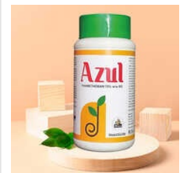
Thiamethoxam 75% W-W SG Insecticide