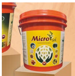
SULHUR 80% WDG FUNGICIDE

500ml Diafenthiuron 47.8% W-W SC Broad Spectrum Systemic Insecticide, Diafenthiuron 47.8% SC Brod Sectrum Systemic Insecticide, Diafenthiuron 47.8% W-W SC Insecticide, Diafenthivron 47.8% W-W SC Brod Sectrum Systemic Insecticide, Emamectin Benzoate 1.9% EC Insecticides, Emamectin Benzoate 5% SG Insecticides And Acaricide, Fipronil 2.92 % W-W EC Insecticides, etc.