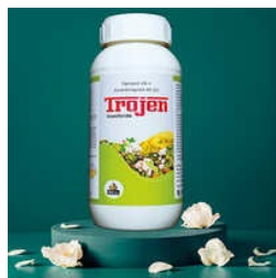
Fipronil 4% Acetamiprid 4% SC