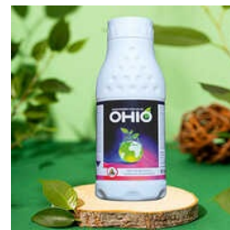
Diafenthivron 47.8% W-W SC Brod Sectrum