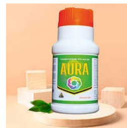
Thiamethoxam 75% W-W SG Insecticide