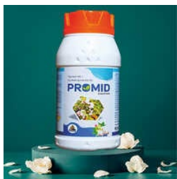
Fipronil 4% Acetamiprid 4% SC