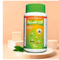
Emamectin Benzoate 5% SG Insecticides And