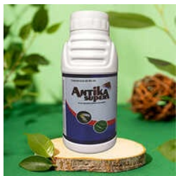
Diafenthiuron 47.8% SC Brod Sectrum Systemic