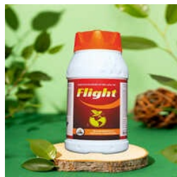
Diafenthiuron 47.8% W-W SC Insecticide