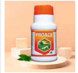
Emamectin Benzoate 5% SG Insecticides And