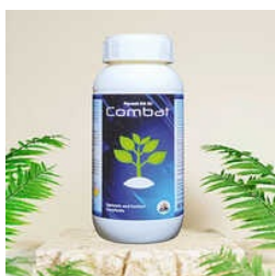
Fipronil 5% SC Systemic And Contant