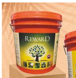
SULPHUR 80% WDG FUNGICIDE