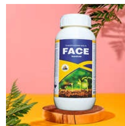
THIAMETHOXAM 30% FS INSECTICIDE