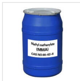
Liquid Methyl Methacrylate