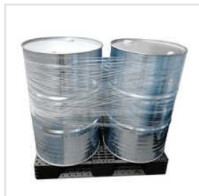
99 Percent Acrylic Acid