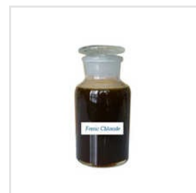
Ferric Chloride Liquid