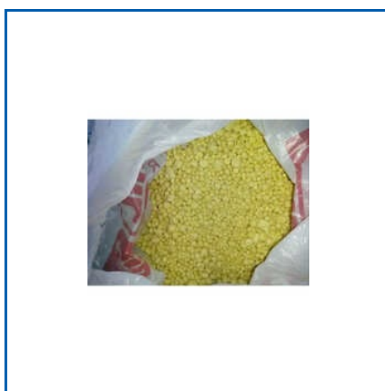
INDUSTRIAL SULPHUR PALLETS