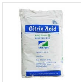
Anhydrous Citric Acid