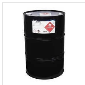
Liquid Ortho Xylene