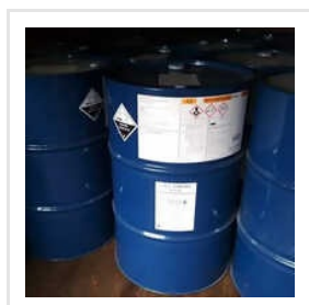
A3 Liquid Diethylenetriamine