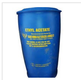
Liquid Ethyl Acetate