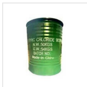
Ferric Chloride Lumps