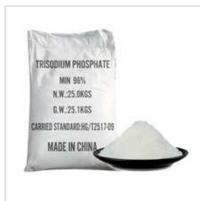
Tri Sodium Phosphate Powder