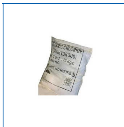
ANHYDROUS FERRIC CHLORIDE