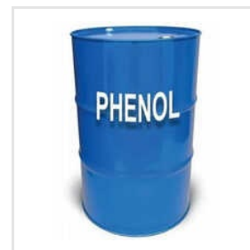
Industrial Phenol Crystal