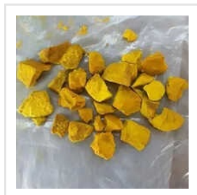
Ferric Chloride Hexahydrate