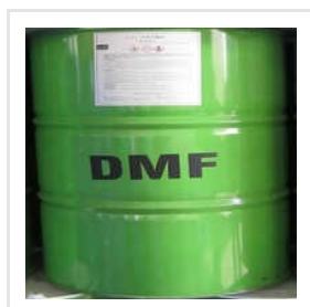
250 Liter Liquid Dimethylformamide