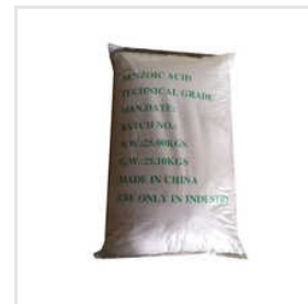
Industrial Benzoic Acid