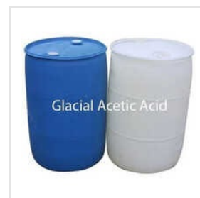
Glacial Acetic Acid