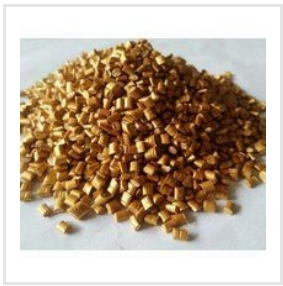
Metallic Effect Masterbatches