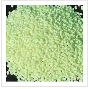
Optical Brightener Masterbatch