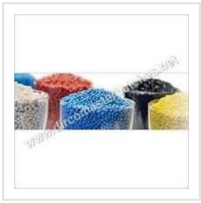
Colour Masterbatch For Plastics Crates