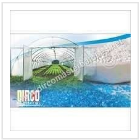
Additive Polymer Masterbatches