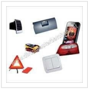
Engineering Plastic Masterbatches