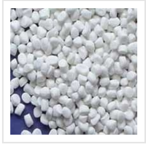
Drip Suppressant Masterbatch