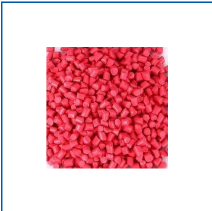
FLUORESCENT RED MASTERBATCH