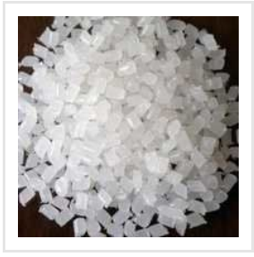
Polymer Processing Aid Masterbatch