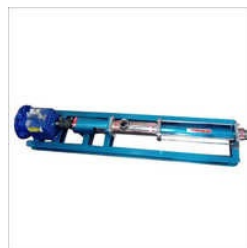
DIRECT DRIVE SCREW PUMP