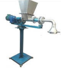
Rotor Stator Pumps