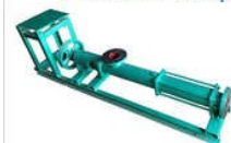
Floroxi Helical Screw Pumps