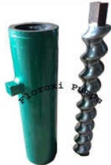
Rotor And Rubber Stator