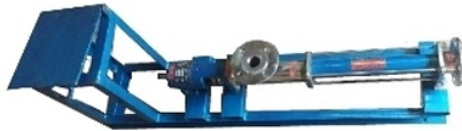
Single Screw Pump