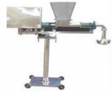
Nylon Sev Extruder