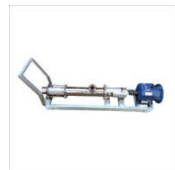
HELICAL SCREW PUMP