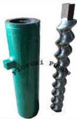
Grout Pump Spares