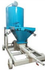
Pressure Grouting Pump