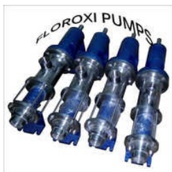
POSITIVE DISPLACEMENT PUMP

Barrel Pumps, Bio Gas Slurry Pump, Butter Transfer Pump, Cement Slurry Pump, Cement Slury Screw Pump, Chemical Dosing Screw Pump, Chemical Screw Pump, Direct Drive Screw Pump, Drum Decanting Pump, Drum Pump, Floroxi Helical Screw Pumps, Floroxi ROTO Pump, Food Grade Screw Pump, Grout Pump Spares, Grouting Pumps, etc.