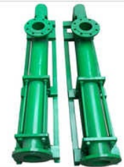
Molasses Transfer Pump