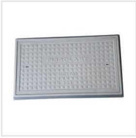
450X900mm Manhole Cover