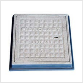
Square Manhole Cover