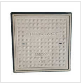
600X600mm Manhole Cover