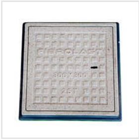
300X300mm Square Manhole Cover