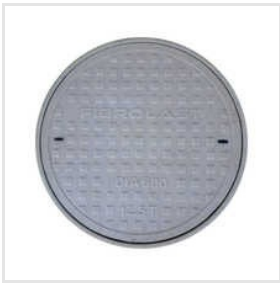
Circular Manhole Cover With Frame