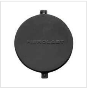
Round OHT Cover