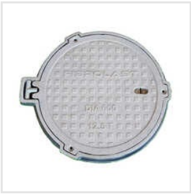
Underground Tank Cover