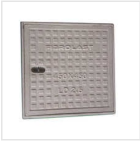
450X450mm Square Manhole Cover