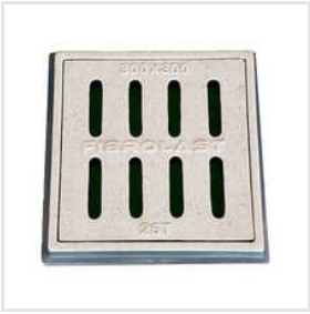
300X300mm Water Gully Cover