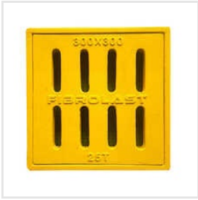
300X300mm Water Gully Cover