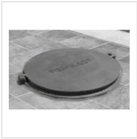
Overhead Tank Cover