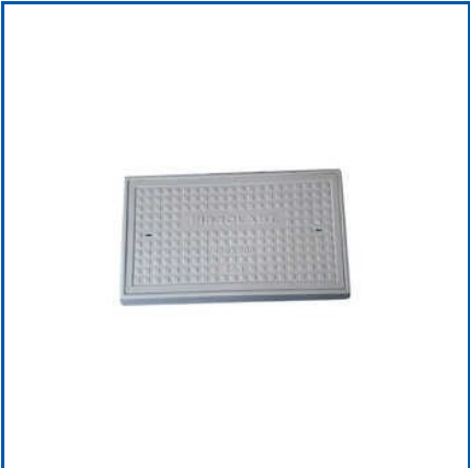
450X900MM RECTANGULAR COVER WITH FRAME