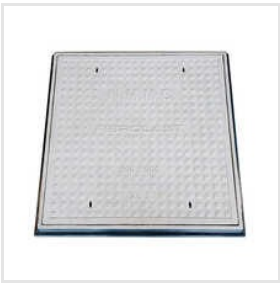
900X900m Manhole Cover