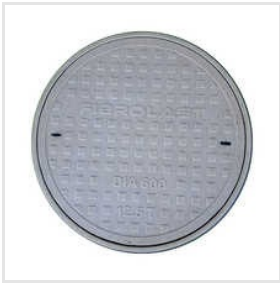
Round Manhole Cover