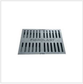
Water Gully Cover Without Frame