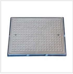
900X600mm Rectangular Manhole