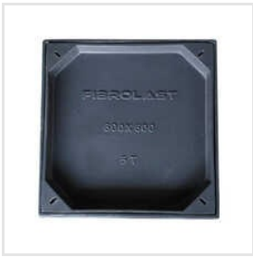
600X600mm Recess Manhole Cover