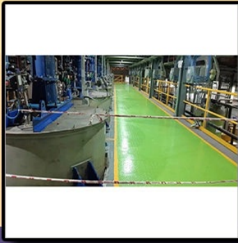
MIXER PLATFORM SITE FABRICATION