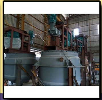
TWIN SHAFT DISPERSER

Basket Filter, Distillation Columns, FRP Mixing Agitator Tanks, GMP Reactor, Heat Exchangers and Condensers, High Speed Mixers, Industrial Chimney, Industrial Reboilers, Jet Mixers, Plough Shear Mixer, Receiver Storage Tanks, Scraped Surface Heat Exchanger, Static Mixers, Tank Mixing Eductor, Twin Shaft Disperser Mixer (TSD), etc.