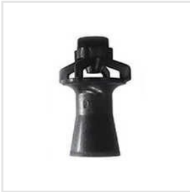
Tank Mixing Eductor