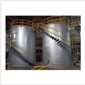
Receiver Storage Tanks