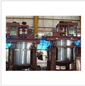
Twin Shaft Dispenser Mixer (TSD)