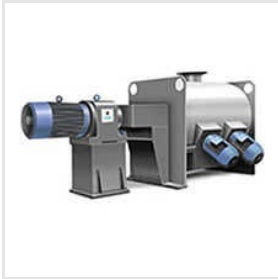
Plough Shear Mixer