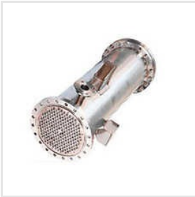
Heat Exchangers And Condensers