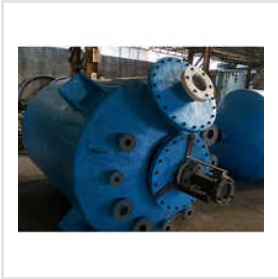
FRP Mixing Agitator Tanks