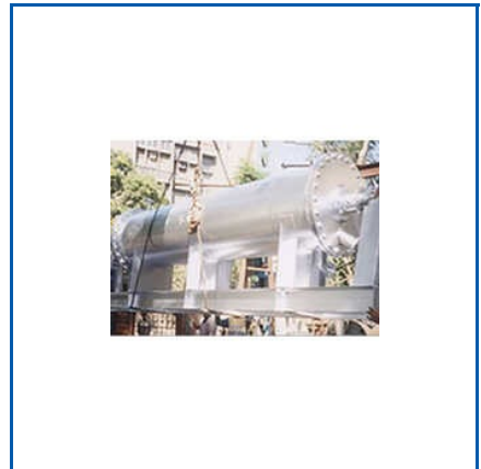
SCRAPED SURFACE HEAT EXCHANGER