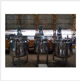
High Speed Mixers