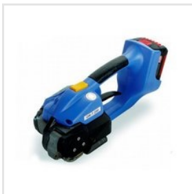
Battery Powered Pet Strapping Tool