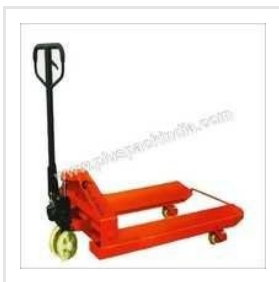
Hydraulic Reel Pallet Truck