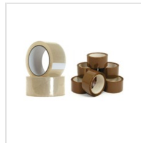
Plastic Adhesive Tape