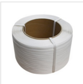
Auto Strapping Rolls