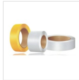
PP Strapping Rolls