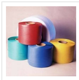
PP Non Virgin Strapping Rolls