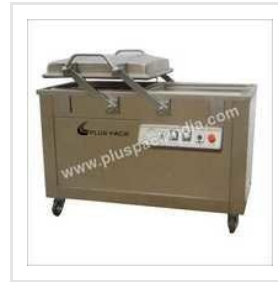
Vacuum Packing Machine