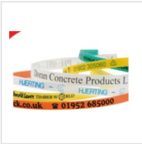
Printed Strapping Roll