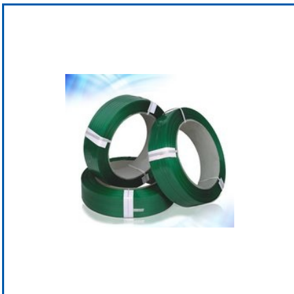
POLYPROPYLENE BOX STRAPPING

Air Flushing Continuous Band Sealer, Auto Strapping Rolls, Automatic Pouch Packing Machine, Automatic Strapping Machine, Battery Powered Pet Strapping Tool, Box Stretch Wrapping Machine, Carton Sealer, Coloured PP Strapping Rolls, Continous Band Sealer Machine, Continuous Vertical Band Sealer Machine, Double Chamber Vacuum Packaging Machine, Dry Ink Batch Coder, Economic Strapping Machine, Electro Magnetic Induction Capper, Evp Pet Strap, etc.