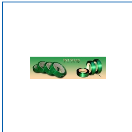
EVP PET STRAP