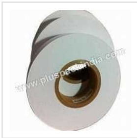
PP Virgin Strapping Rolls