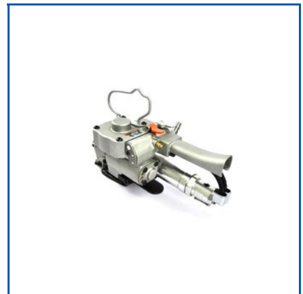
PNEUMATIC PET STRAPPING TOOL