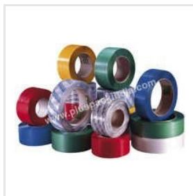
Coloured PP Strapping Rolls