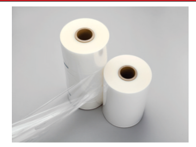
POLY SHRINK FILM