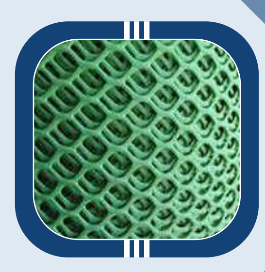
GI Garden Fencing