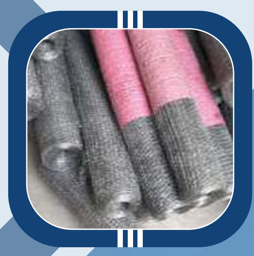
Hex Wire Mesh Jali