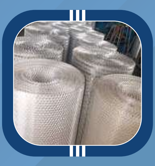
Aluminium Wire Mesh