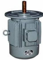
Textile Machines Motors