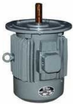
220V Electric Motor