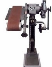
Abrasive Belt Grinder