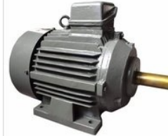
Three Phase Electric Motors