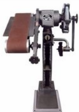
Endless Belt Grinder