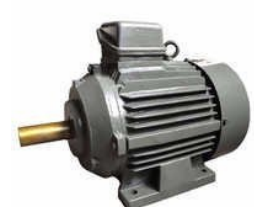
Flour Mill Electric Motor