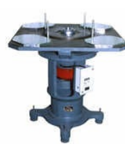
Triple-D Diamond Polishing Machine