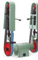
Lancer Belt Grinding Machine