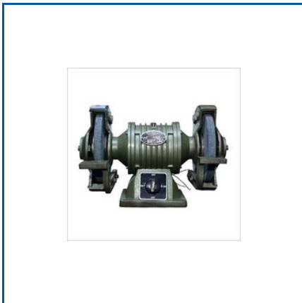
220V BENCH GRINDER

1 Phase Standard Electric Motor, 220V Electric Motor, 220v Bench Grinder, 3 Phase Standard Electric Motor, 4 In 1 Shuttle Repairing Grinder, AC Brake Motors, AC Geared Motor, Abrasive Belt Grinder, Aerator Gearbox, Aluminum Body Worm Gear Box, BUFFING MACHINE, Belt Disc Sander, Belt Sander, Belt and Disc Grinder, Bench Grinder, etc.