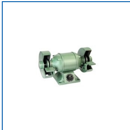
ELECTRIC BENCH GRINDER