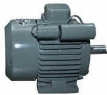
Industrial Electric Motors