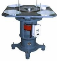
Diamond Polishing Machine