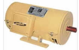
DC Shunt Motor