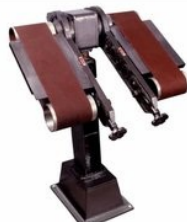
Double Belt Grinder