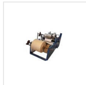
Automatic Lamination Machine