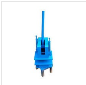
Slipper Cutting Machine