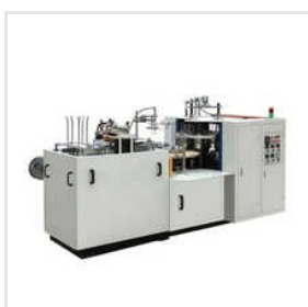
Industrial Paper Cup Making Machine