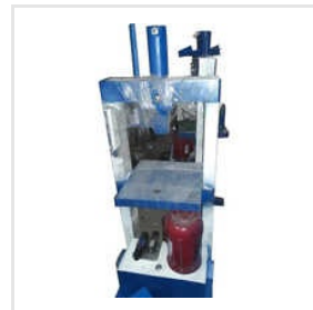
Single Die Paper Plate Making Machine