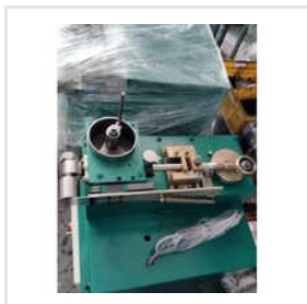
Dhoop Stick Cutting Machine