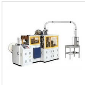
Stainless Steel Paper Cup Making Machine