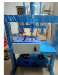
DOUBLE DIE PAPER PLATE MAKING MACHINE