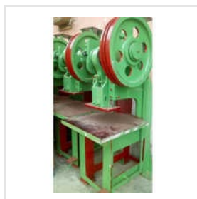
Semi Automatic Slipper Making