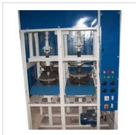
Fully Automatic Dona Making Machine