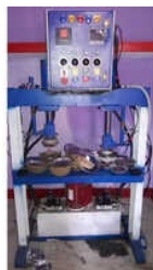
DOUBLE CYLINDER PAPER PLATE MAKING MACHINE