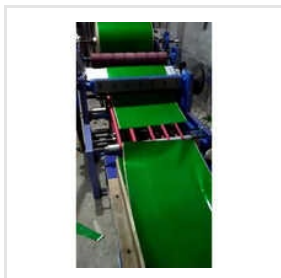
Roll Sheet Cutting Machine