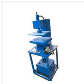
Hydraulic Slipper Making Machine