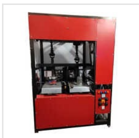
Double Die Dona Making Machine