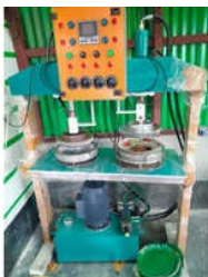
DISPOSABLE PLATE MAKING MACHINE

Automatic Continue Band Sealing Machine, Automatic Lamination Machine, Automatic Mixture Machine, Automatic Non Woven Bags Making Machine, Automatic Noodles Making Machine, Automatic Paper Cup Making Machine, Automatic Paper Glass Making Machine, Automatic Paper Roll Making Machine, Automatic Punching Machine, Blower Type Pulverizer Machine, D Cut Bag Making Machine, Dhoop Stick Cutting Machine, Disposable Plate Making Machine, Dona Plate Making Machine, Double Cylinder Paper Plate Making Machine, etc.