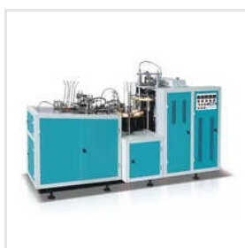
Electric Paper Cup Making Machine