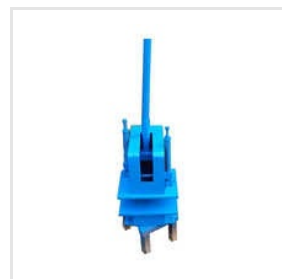
Manual Slipper Making Machine