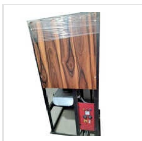
Single Die Dona Making Machine