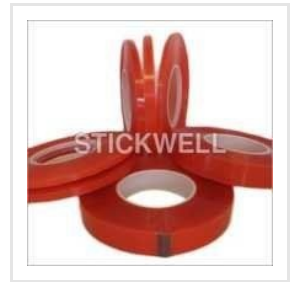
D S Polyester Tapes