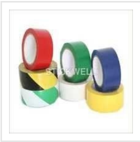
Floor Marking Tape