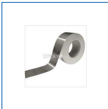
ALUMINUM FOIL TAPE