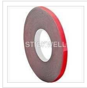
Double Sided Tape