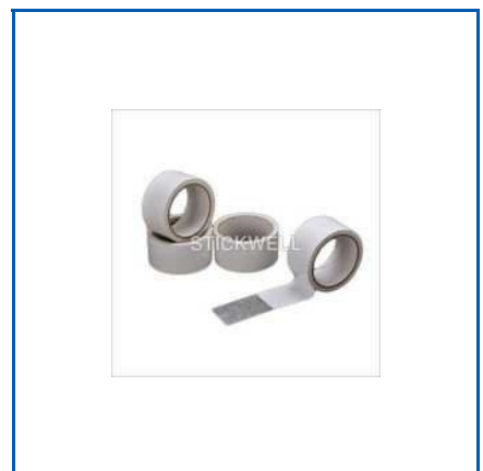
DOUBLE SIDED TISSUE TAPE