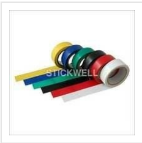
Electrical Insulation Tapes