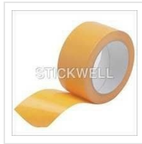
Double Sided Cloth Tape