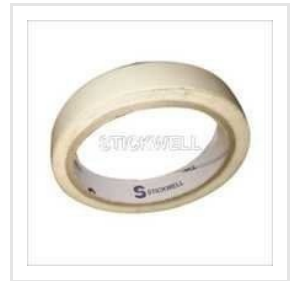
Paper Masking Tape