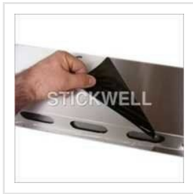
Surface Protection Tapes