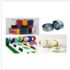
Speciality Adhesive Tapes