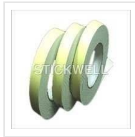
Double Sided Foam Tape