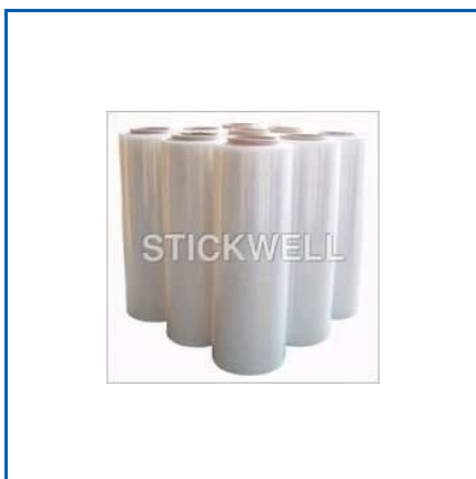
STRETCH FILM ROLL

Acrylic Foam Tape, Aluminum Foil Tape, Bopp Adhesive Tapes, Bopp Tapes, Box Strapping Roll, Cello Tape, Cloth Tapes, Color Bopp Tapes, Customized Printed Bopp Tapes, D S Polyester Tapes, Double Sided Cloth Tape, Double Sided Foam Tape, Double Sided Tape, Double Sided Tissue Tape, Duct Tapes, etc.