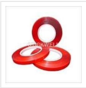
Acrylic Foam Tape