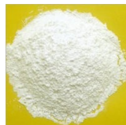
Hydroxy Propyl Methyl Cellulose HPMC