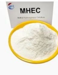
METHYL HYDROXY ETHYL CELLULOSE