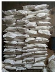
Calcium Chloride Powder