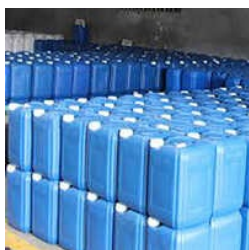
Inc Can Preservative