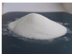
REDISPERSIBLE POLYMER POWDER

Air Remove Powder, Blue Iron Oxide, CALCIUM LIGNO SULPHONATE POWDER, Calcium Chloride Powder, Calcium Formate, Calcium Formate Powder, Calcium Formate Powder 98% Tech (Cafo Powder), Calcium Nitrate, Carboxy Methyl Cellulose (CMC Powder), Cellulose Fiber, Dispersing Agent, Dry Film Preservative, High Alumina Cement, Hollow Glass Microspheres, Hydrophobic Agent (Additives), etc.