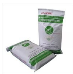
HYDROXY ETHYL CELLULOSE POWDER