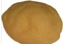
SODIUM NAPHTHALENE FORMALDEHYDE