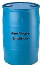
VAM Acrylic Emulsions