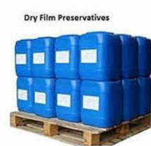
Dry Film Preservative