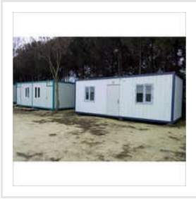
Portable House Container