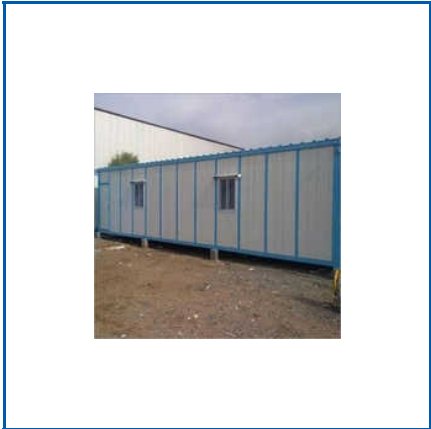
PORTABLE SITE OFFICE CABIN