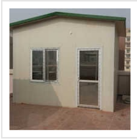
Roof Top Cabin