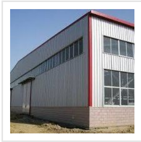
PEB Steel Building