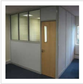
Office Insulated Partitions