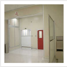
Fire Protection Insulated Partitions