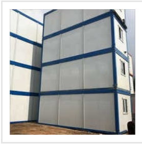
Portable Office Container