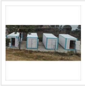
Industrial Office Container