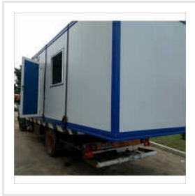
Truck House Container