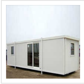
Portable Office Cabin