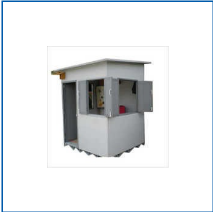
PORTABLE GUARD CABIN