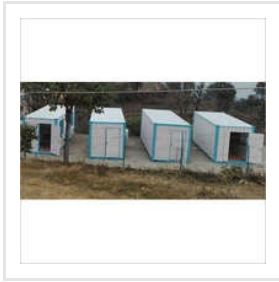
Industrial Office Container