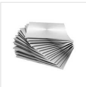
1100 Aluminium Alloys Plate