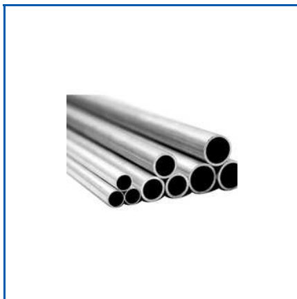
7075 ALUMINIUM ALLOY ROUND PIPES

Mild Steel Ingot , 17.4PH, 303 round bar , 304l round bar, 316 round bar , 316l round bar, 317 round bar, 347, 409 round bar, 409L ROUND BAR, 409m round bar, 410 ROUND BAR , 410S ROUND BAR, 420 ROUND BAR, 421 Bar, etc.