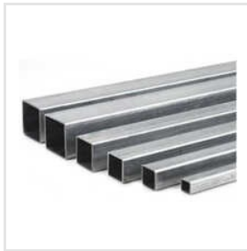
2024 Aluminium Alloys Square Pipes