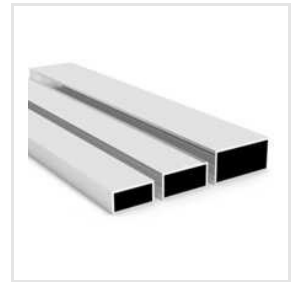
7075 Aluminium Alloys Rectangular Pipes