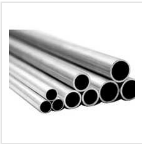
2024 Aluminium Alloy Round Pipes