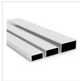
2024 Aluminium Alloys Rectangular Pipes