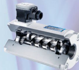
Screw Type PD Flowmeter