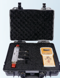
Hydraulic Oil Tester