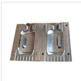
HDPE Blow Moulds