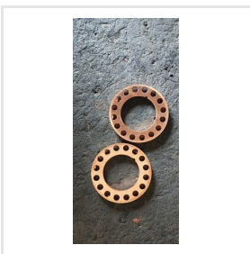
Sheet Metal Pressed Parts