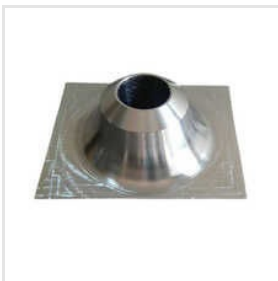
CNC Milled Component