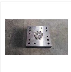
Progressive Press Tool