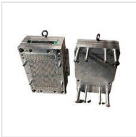
Plastic Injection Mould