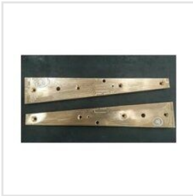
Machining Job Work