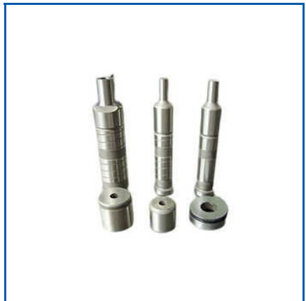
TURRET PUNCH PRESS TOOLING