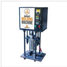
Hand Moulding Machine