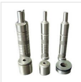
Turret Punch Press Tooling