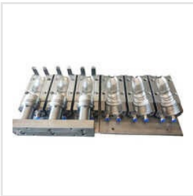
Pet Blow Moulds