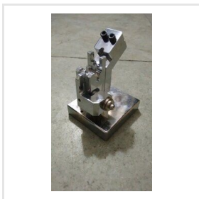
Jigs & Fixtures