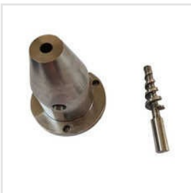
CNC Turned Component