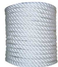
Diamond Comboflex Rope