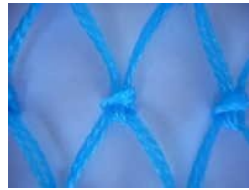
HDPE Twisted Nets (Double)