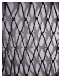
HDPE Braided Nets (Double)