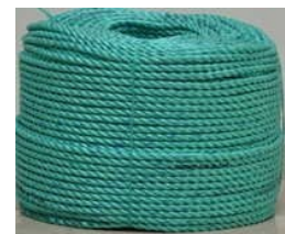
DIAMOND HI-TECH ROPE