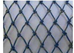
Braided Saffayar Nets