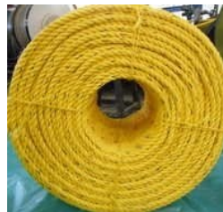
Diamond Industrial Rope