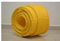
DIAMOND 3 STRAND PP ROPE

Baler Twine, Braided Saffayar Nets, Braided Twine, Diamond 3 Strand PP Rope, Diamond Comboflex Rope, Diamond HDPE Rope, Diamond Hi-Tech Rope, Diamond Industrial Rope, Diamond Multifilament (Nylon) Rope, HDPE Braided Nets (Double), HDPE Braided Nets (Single), HDPE Twine, HDPE Twisted Nets (Double), HDPE Twisted Nets (Single), Orthocop Powder, etc.