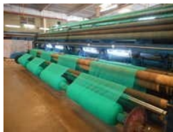
HDPE Braided Nets (Single)