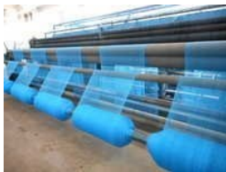
HDPE Twisted Nets (Single)