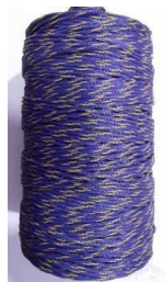
Saffayar Braided Twine