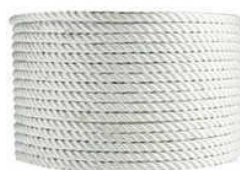
DIAMOND MULTIFILAMENT (NYLON) ROPE