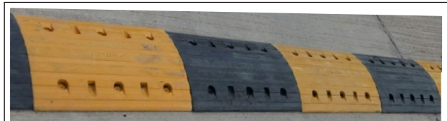
Size :-500 x 400 x 75mm.