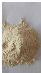
Organic Juvar/Sorghum Flour