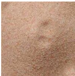
ORGANIC HIMALAYAN PINK ROCK SALT

Black Papper/kali mirch, Organic Barnyard Millet, Organic Raw Sugar/Khandasari, Organic Wheat suji/Semoline, Organic Yellow Maize/Makki Flour, Organic A2 Cow Ghee, Organic Almond (Badam), Organic Bajari/Millet, Organic Barley /Jav Flour, Organic Basmati White Rice, Organic Besan (Gram Flour), Organic Black Mustard Oil (Cold Pressed), Organic Black Salt, Organic Brown Sugar, Organic Brown Sugar( Dark), etc.