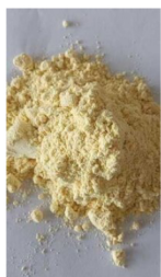
Organic Yellow Maize/Makki Flour