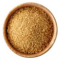
ORGANIC BROWN SUGAR