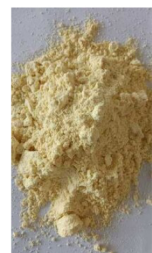
Organic Besan (Gram Flour)