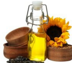
Organic Sunflower Oil (Cold Pressed)