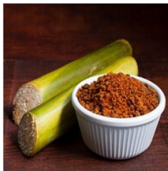
ORGANIC JAGGERY POWDER