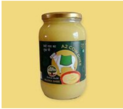
Organic A2 Cow Ghee