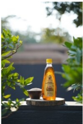
Organic Sesame Oil