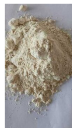
Organice Wheat Flour