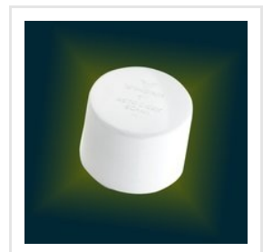
UPVC End Cap