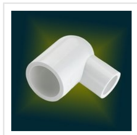
UPVC Reducer Elbow