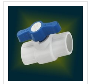
UPVC Ball Valve