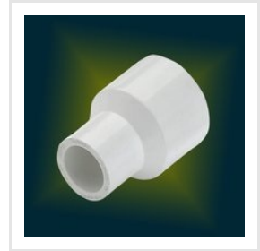
UPVC Reducer Coupler