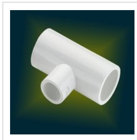
UPVC Reducer Tee