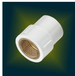
BRASS FTA FITTING