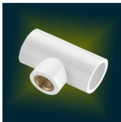
BRASS REDUCER TEE

BRASS HORIZONTAL NRV, Ball Valve, Brass Angle Cock, Brass Bib Cock, Brass Extension Nipple, Brass FTA Fitting, Brass Forged Ball Valve, Brass MTA Fitting, Brass Reducer Elbow, Brass Reducer Tee, Brass Tee, Brass Vertical Check Valve (NRV), CPVC Brass Elbow, CPVC Brass MTA, CPVC Cross Tee, etc.