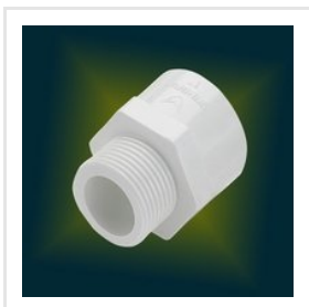
UPVC MTA Fitting