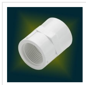
UPVC FTA Fitting