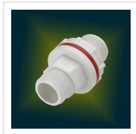
UPVC Tank Connector