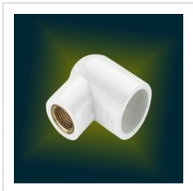
Brass Reducer Elbow