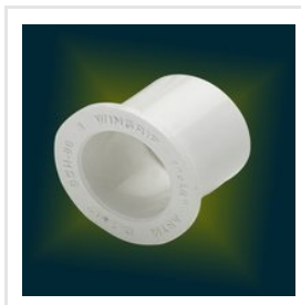
UPVC Reducer Bush