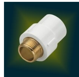
BRASS MTA FITTING