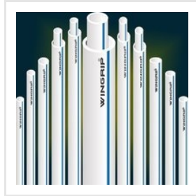
Upvc Plumbing Pipes Sch-40