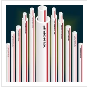
Upvc Plumbing Pipe Sch-80