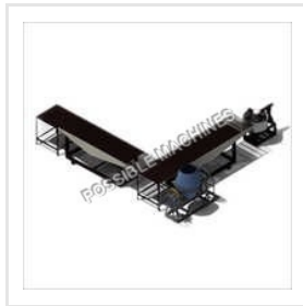
Vibro Set Up For Paver Block Making