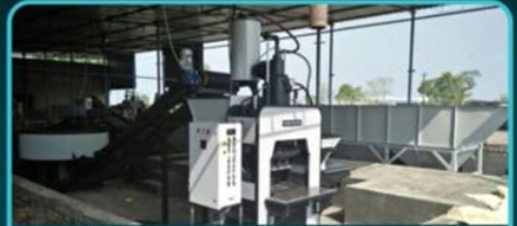
Higher Grade Paver Block Making Machine