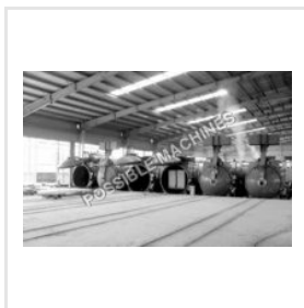
AAC Block Making Machine Plant