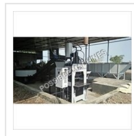
M-50 Grade Paver Blocks Making