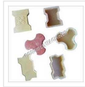
PVC Rubber Mould