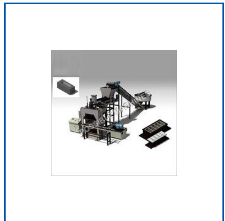
PM40 FLY ASH BRICK MAKING MACHINE