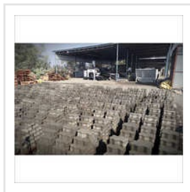
HYDRAULIC PAVER BLOCKS MAKING