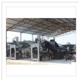
M-50 Grade Paver Blocks Making