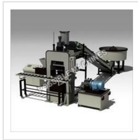
PM24 Automatic Fly Ash Brick Making