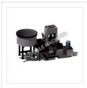
Manual Paver Block/ Fly Ash Brick Making