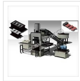
(PMA32) Automatic Paver Blocks / Fly