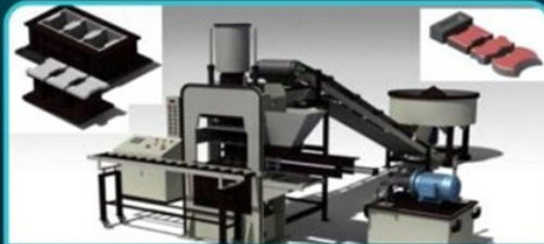
Fly Ash Brick and Paver Block Making Machine