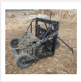
Hydraulic Pallet Truck (Capacity