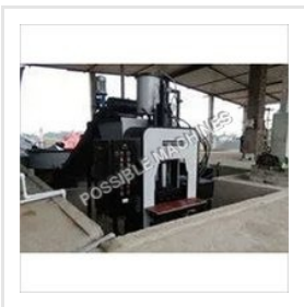
(PMA24) Automatic Paver Block / Fly Ash