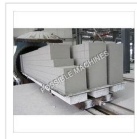
AAC Block Making Machine Plant