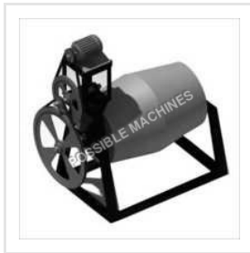
Color Mixer Drum