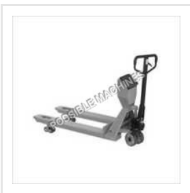
Hand Pallet Truck (Capacity 2500kg)