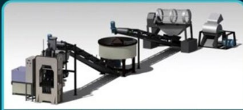
CSEB Block Making Machine