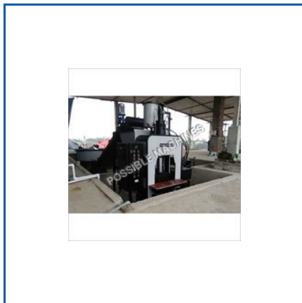
PM32 AUTOMATIC FLY ASH BRICKS MAKING MACHINE PLANT