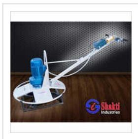
Trowel Cum Floater Machine