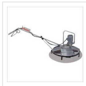
Concrete Power Trowel Cum Floater Machine