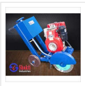
RCC Groove Cutting Machine