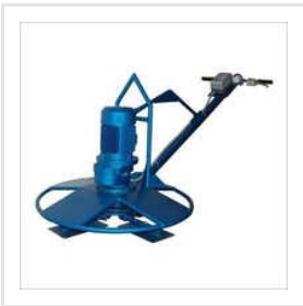
3 HP Power Trowel Machine