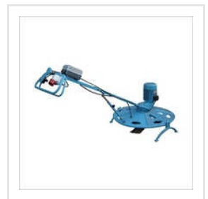
Concrete Power Floater Machine