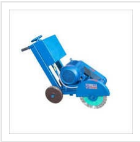
3 Phase Concrete Road Cutting Machine