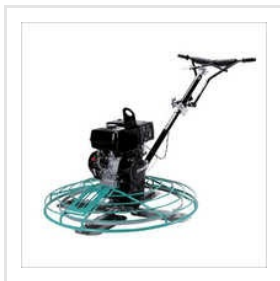
5 HP Engine Power Floater Machine