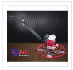
3 Phase Power Trowel Machine