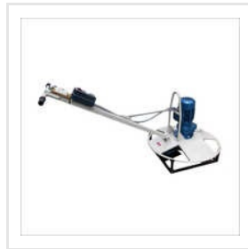
Dual Speed Power Trowel Cum Floater