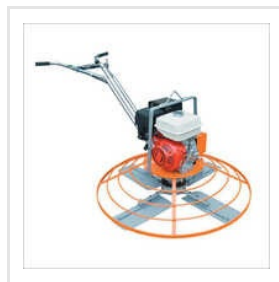
Concrete Trowel Machine