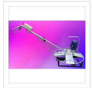
Electric Power Trowel Machine