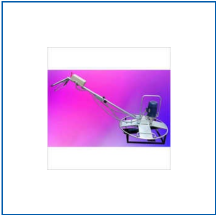
3 PHASE POWER TROWEL CUM FLOATER MACHINE