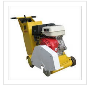
Petrol Concrete Road Cutting Machine