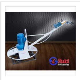
Concrete Power Trowel Machine