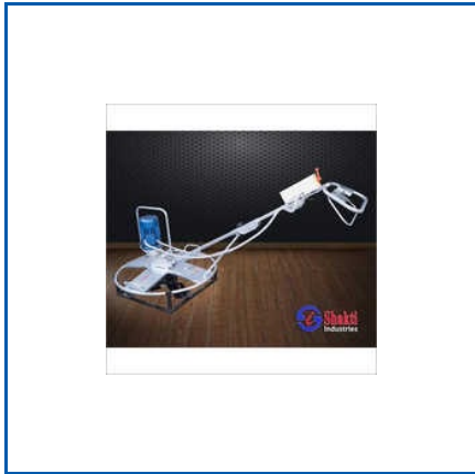
POWER TROWEL CUM FLOATER MACHINE