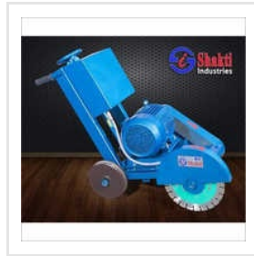
415 V Concrete Cutting Machine