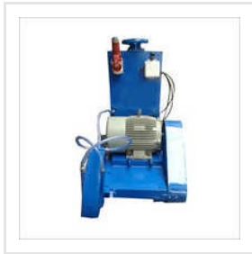
Road Groove Cutting Machine