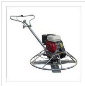
Mild Steel Power Trowel Floater Machine