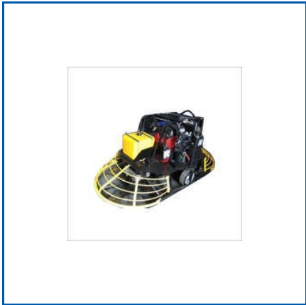
24 HP RIDE ON TROWEL MACHINE

24 HP Ride On Trowel Machine, 3 HP Power Trowel Machine, 3 Phase Concrete Road Cutting Machine, 3 Phase Power Trowel Cum Floater Machine, 3 Phase Power Trowel Machine, 3 Phase Truss Screed Vibrator, etc.