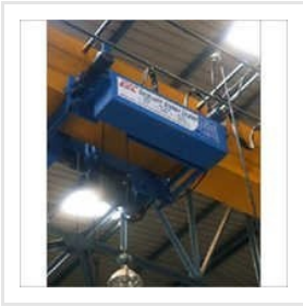
Modular Electric Wire Rope Hoist