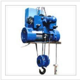
Conventional Wire Rope Hoists