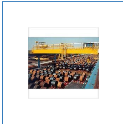
STEEL MILL WORK CRANES