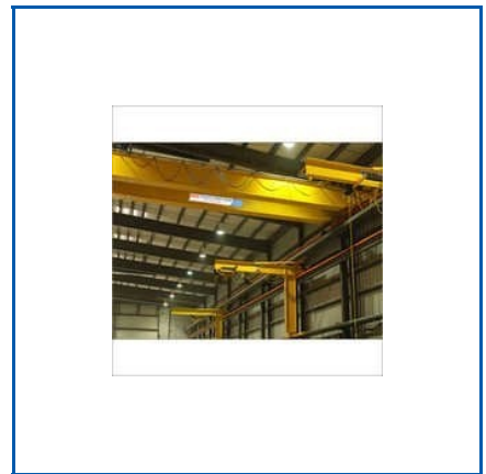
OVERHEAD TRAVELLING CRANES