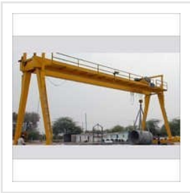
Custom Built Overhead Cranes