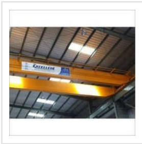
Single Girder Overhead Cranes