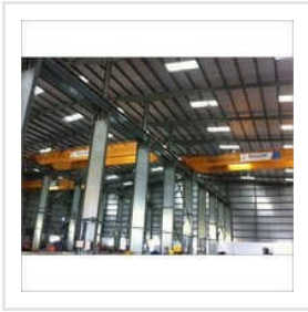
Overhead Gantry Crane