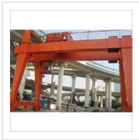
Multi Girder Goliath Cranes