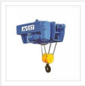
Portable Wire Rope Hoists