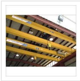
Double Girder Overhead Cranes