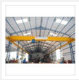
Single Girder EOT Cranes