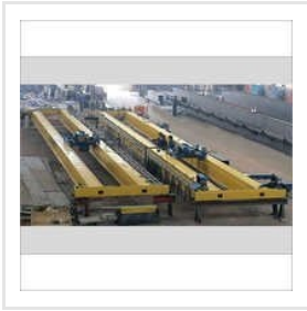
Wire Rope Hoists