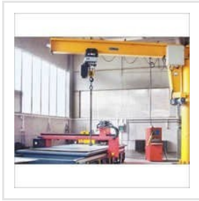
Electric Wire Rope Hoist