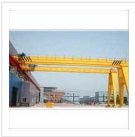
Single Girder Semi Goliath Cranes