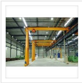
Wall Mounted Cranes