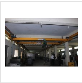
Underslung Overhead Traveling Crane