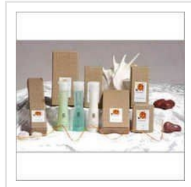
Hotel Guest Toiletries