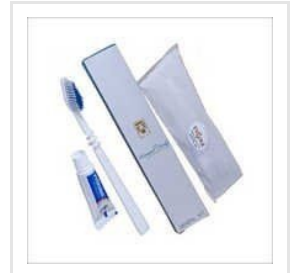
Hotel Dental Kit