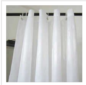
Hotel Shower Curtains