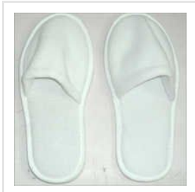
Hotel Bathroom Slippers