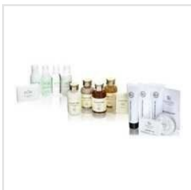
Hotel Guest Amenities