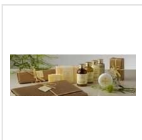
Luxury Hotel Toiletries