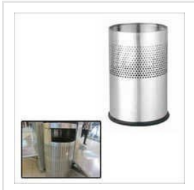
SS Office Dustbin