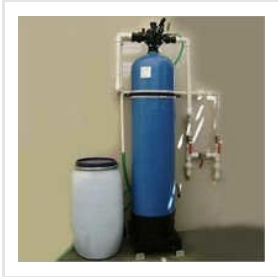
Water Softener Plant