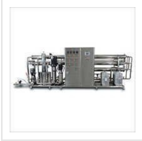
RO EDI Plant