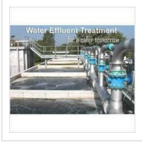
Sewage Water Effluents Plant