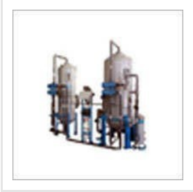
Activated Carbon Filter