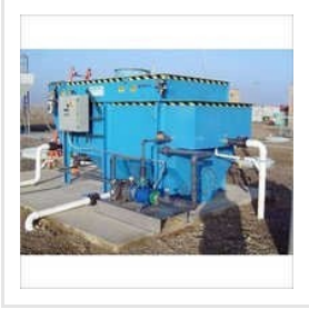
Effluent Treatment Plant