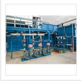
Industrial Sewage Treatment Plant