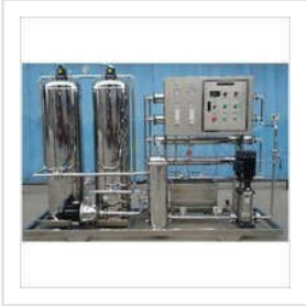
Stainless Steel RO Plant