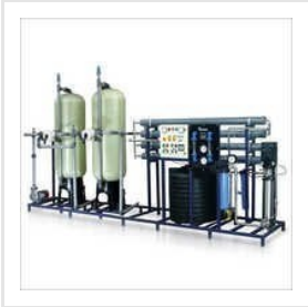
Commercial RO Plant