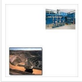
Sewage Treatment Plant For Mining