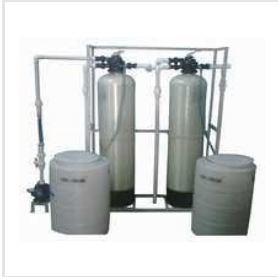
Domestic RO Plant