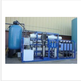
Reverse Osmosis Plant For Hospitals