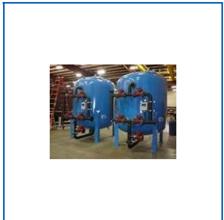
DUAL MEDIA FILTER