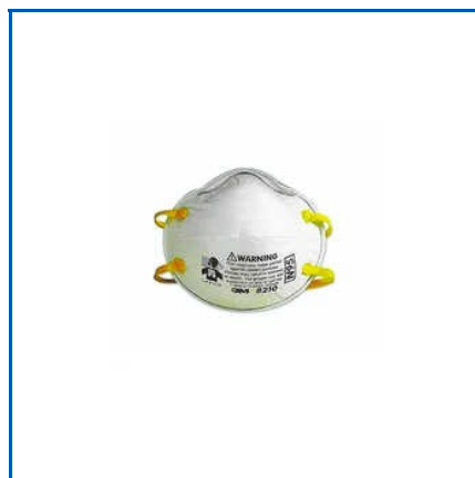
3 M 8210 SAFETY FACE MASK