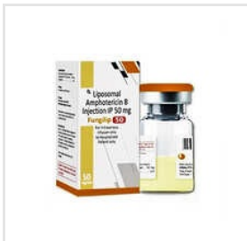
50mg Liposomal Amphotericin B