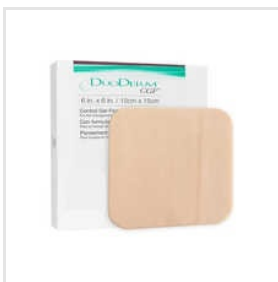
Duoderm CGF Wound Dressing