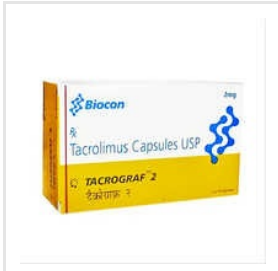
Tacrograf Capsules USP