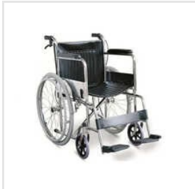
Manual Folding Wheelchair