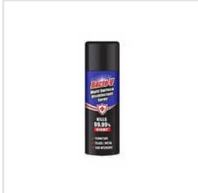
Bacto V Multisurface Disinfectant Spray