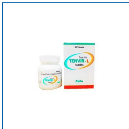
TENVIR L TABLETS

3 M 8210 Safety Face Mask, 4000 IU Injection IP, 500mg Gamma I.V. Injection, 50mg Liposomal Amphotericin B Injction IP, Aldomet 250mg, Aldomet 250mg Methyldopa 250mg, Alpha Ketoanalogue Tablets, Arpimune ME tablets 25mg, Bacto V Multisurface Disinfectant Spray, Bevac vaccine, Bevacirel 16mg injection, Capsy 500mg, Cipla Nicotex Gum, Dargen 25mcg, Digital Weighing Scale, etc.