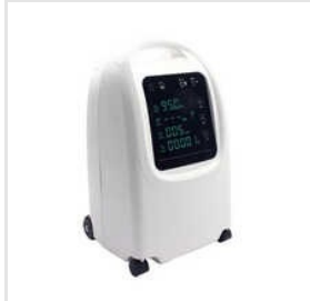
Hospital Oxygen Concentrator Machine