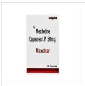
Mexohar 50mg Capsules