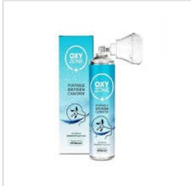
Oxyzone Plus Portable Oxygen Canister