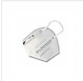
N95 Oxy Face Mask