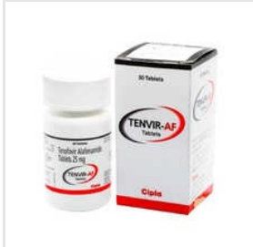
Tenvir Af Tablets