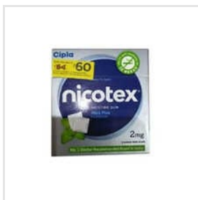
Cipla Nicotex Gum