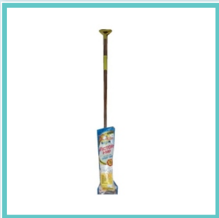
Victor Cotton Cleaning Mop