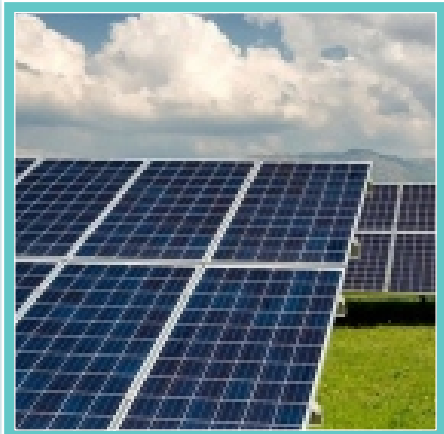
Solar Energy Power Plant