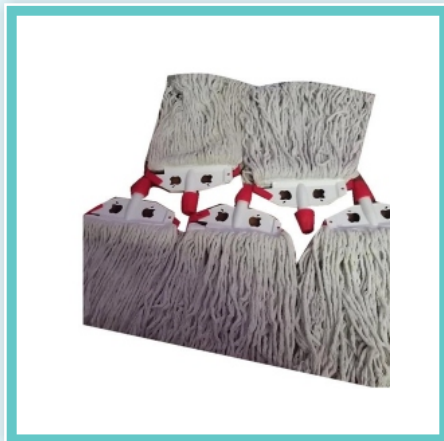
3g Cotton Cleaning Mop