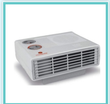
Electric Air Heater Blower