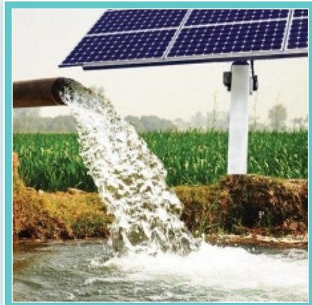
Solar Pump Set