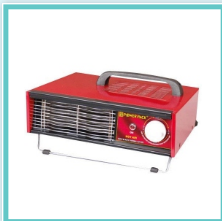
Bajaj Flash Room Heater