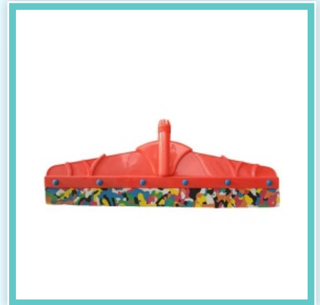
21 Inch Meena Floor Wiper