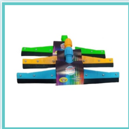
18 Inch Plastic Floor Cleaning Wiper