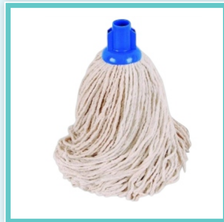
Round Floor Cleaning Cotton Mop