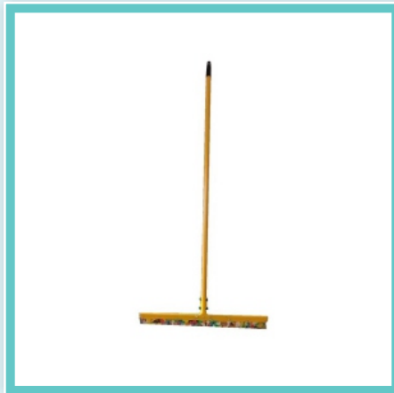
Meena Floor Cleaning Wiper