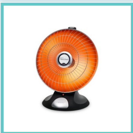
Sun Room Heater