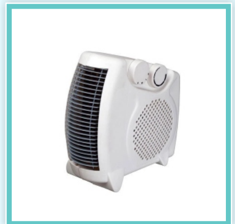
Room Heater Blower