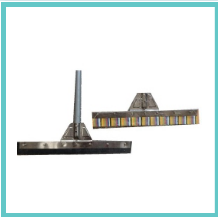
Heavy Duty Floor Wiper