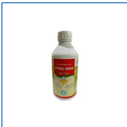
CYPERMETHRIN 25% EC CYPKILL SUPER INSECTICIDE