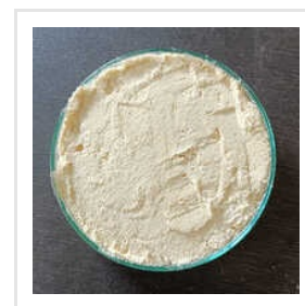
Imidaclopride Agro Technical Chemical