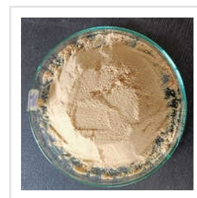
Thiamethoxam Agro Technical Chemical