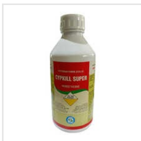
Cypermethrin 25% EC Cypkill Super