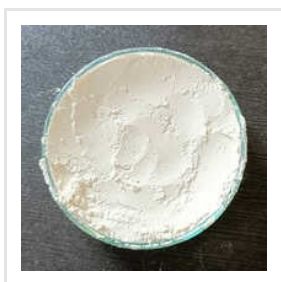
Chlorantaniliprole 8.8 % Plus Thiamethoxam