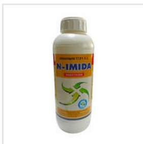
N Imida Imidacloprid 17.8% SL Insecticide