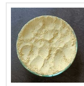
Mancozeb 80% Agro Chemical