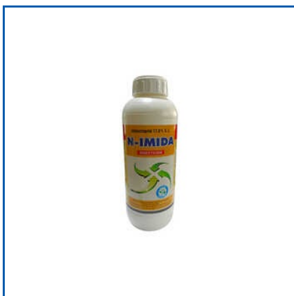
N IMIDA IMIDACLOPRID 17.8% SL INSECTICIDE

Chlorantaniliprole 8.8 % Plus Thiamethoxam 17.5 % SC, Chlorantraniliprole Agro Technical Chemical, Cypermethrin 25% EC Cypkill Super Insecticide, Imidacloprid 17.800 SL, Imidacloprid 30.500 SC, Imidaclopride Agro Technical Chemical, Mancozeb 80% Agro Chemical, N Imida Imidacloprid 17.8% SL Insecticide, Thiamethoxam 12.6% Plus Lambda-Cyhalothrin 9.5 % ZC, Thiamethoxam Agro Technical Chemical, Thiomethoxam 25% WG, etc.