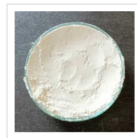
Imidacloprid 30.500 SC