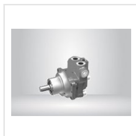
Internal Gear Unit QXM-HS