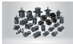
DANFOSS ORBITAL MOTOR