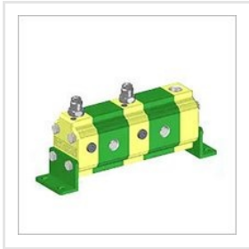
Flow Divider Valves-Group 1