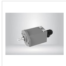
Internal Gear Motor QXM-Mobil