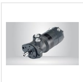
Brake And Motors Combinations