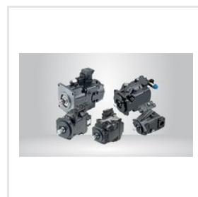
Open Circuit Axial Piston Pumps