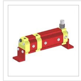
Flow Divider Single Valve Motor-Group 0