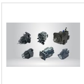
Hydrostatic Danfoss Motor