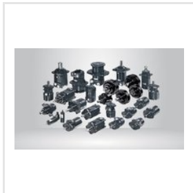
Danfoss Orbital Motor