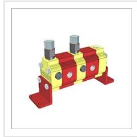
Flow Divider Valves-Group 0