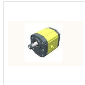
Unidirectional Hydraulic Motors 50 HY