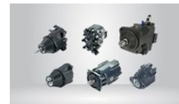
HYDROSTATIC DANFOSS MOTOR