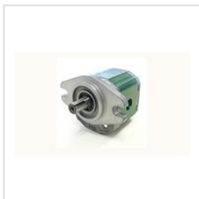
Unidirectional Hydraulic Motors