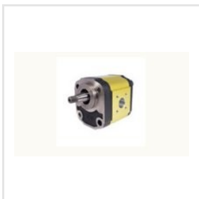
HY Type Motor A 50 Cast Iron Flange GU213