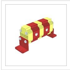
Flow Divider Without Valves-Group 0