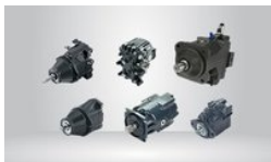
CLOSED CIRCUIT AXIAL PISTON MOTORS

Accessories For Pump, Accessories for Bucher Valve, BH Primary Pump A 50 Cast Iron Flange GT210, BH Type Motor A, 50 Cast Iron Flange Gm210, BH Type Pump A 50 Cast Iron Flange GR210, Brake and Motors Combinations, Bucher, Bucher Valve Accessories, Closed Circuit Axial Piston Motors, Closed Circuit Axial Piston Pumps, DCV Directional Control Valves, Danfoss, Danfoss Closed Circuit Axial Piston Pumps, Danfoss DCV Directional Control Valves, etc.