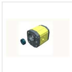
Unidirectional Hydraulic Motors A,52