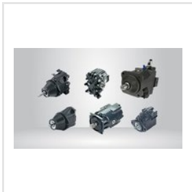
Closed Circuit Axial Piston Motors