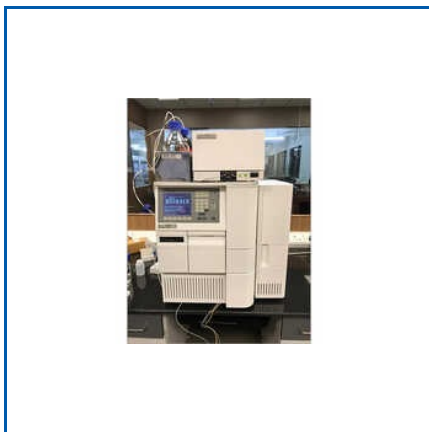
REFURBISHED HIGH PERFORMANCE ECOM HIGH PERFORMANCE LIQUID CHROMATOGRAPHY SYSTEM

Chromatography Apparatus, Cylinder Regulator, Digital Polarimeters, Exhaust Hood, Fume Hood, Gas Chromatograph, Gas Control Panels, Gas Cylinder Manifolds, Gas Distribution System, Gas Pipe Fittings, Gas Purification System, Hydrogen Generators, Laboratory Fume Hoods, Medical Gas Control Panel, Nitrogen Generator, etc.