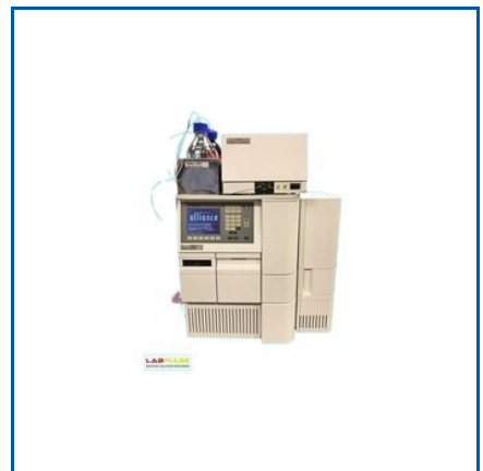
REFURBISHED HIGH PERFORMANCE LIQUID CHROMATOGRAPHY SYSTEM