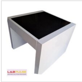
Laboratory Anti Vibrating Table