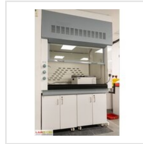
Laboratory Fume Hood