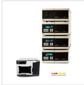
Ecom High Performance Liquid