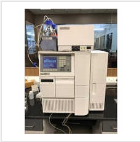
Refurbished High Performance Liquid