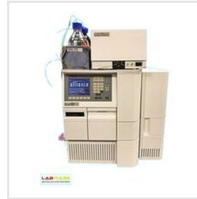
Refurbished High Performance Liquid