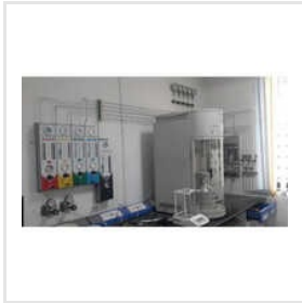
Laboratory Gas Purification System