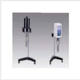
Laboratory Digital Viscometer