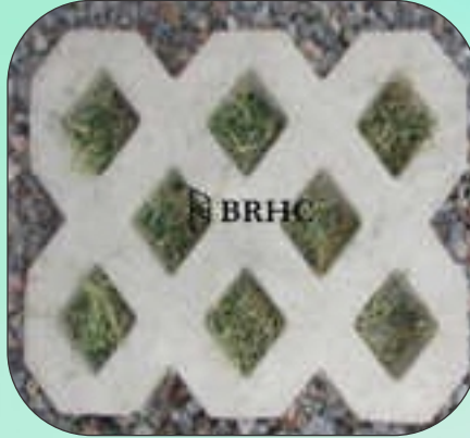
Concrete Grass Paver