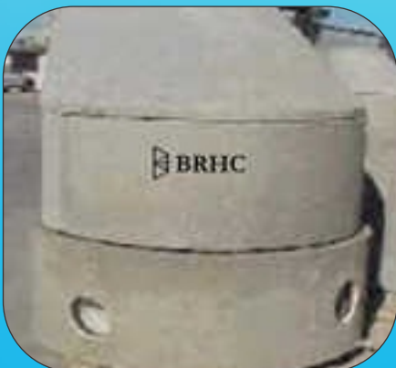
Concrete Manhole System