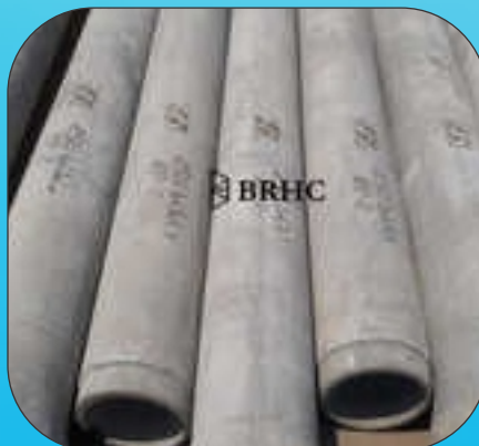
RCC Round Pipes