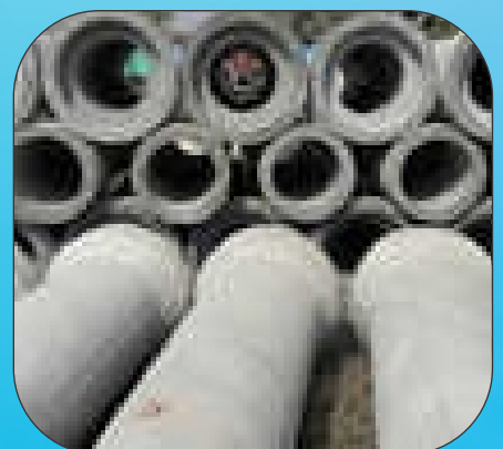
Rcc Pipes 1600mm Dia Class Np2