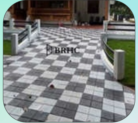
Interlocking Paver Tile