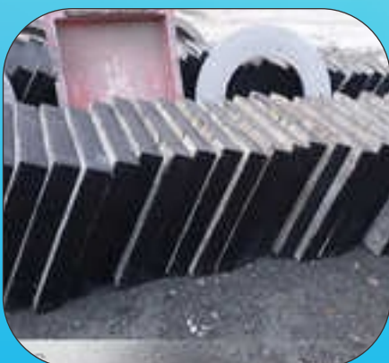
Rcc Square Manhole Set