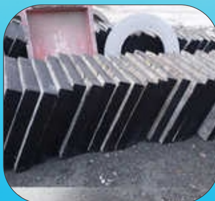
Extra Heavy Duty Manhole Cover And Frame