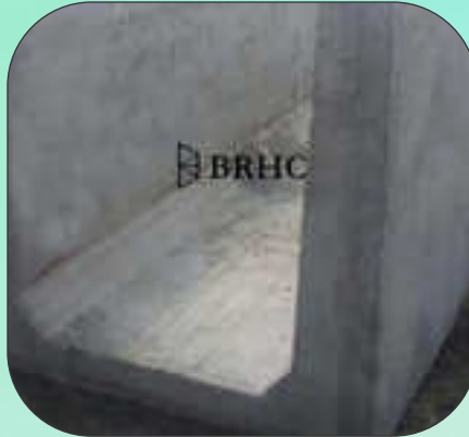
RCC U Drain