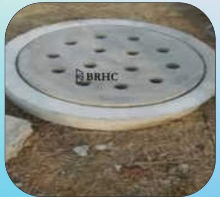
Concrete Manhole Cover