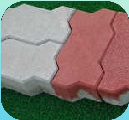
80 Mm Zigzag Interlocking Tiles