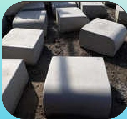
Concrete Kerb Stone