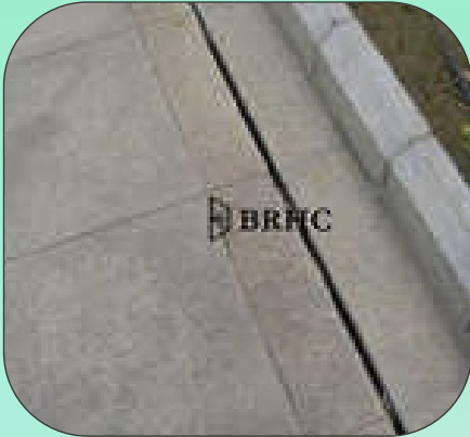
RCC Slit Drain