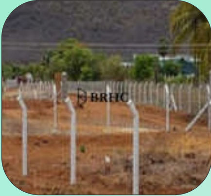
Concrete Fencing Pole