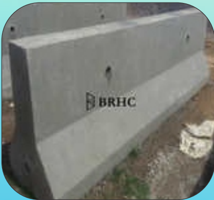
Concrete Jersey Barrier