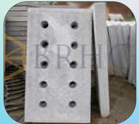
Light Duty Precast Concrete Drain Cover