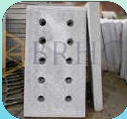
Medium Duty Precast Concrete Drain Cover