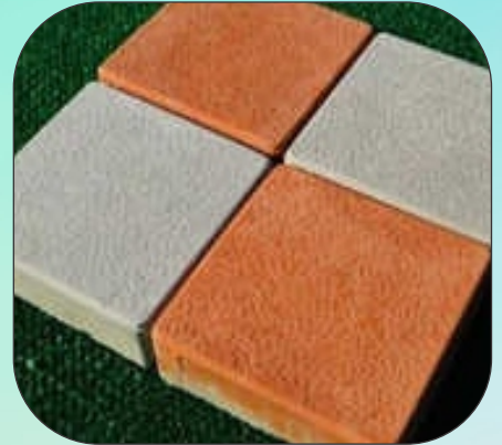
80 MM Square Interlocking Tiles