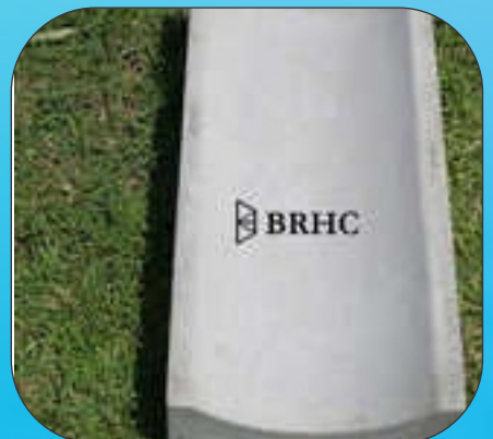
RCC Curve Saucer Drain