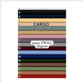
265 GM Cargo Twill Laffer Fabric