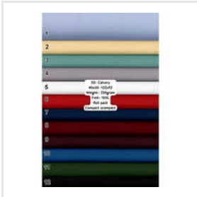
250 GM 40x30 5D Calvary Twill Fabric