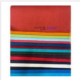
40x40 58 Inch Armani Plain Satin Fabric