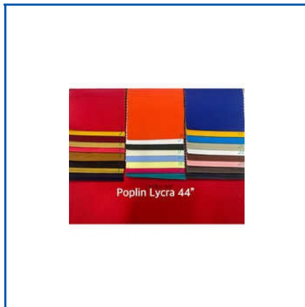
44 INCH POPLIN LYCRA FABRIC