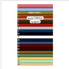
240 GM 30x30 Gima Twill Fabric