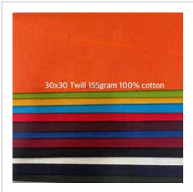
155 GM 30x30 100% Cotton Twill Fabric