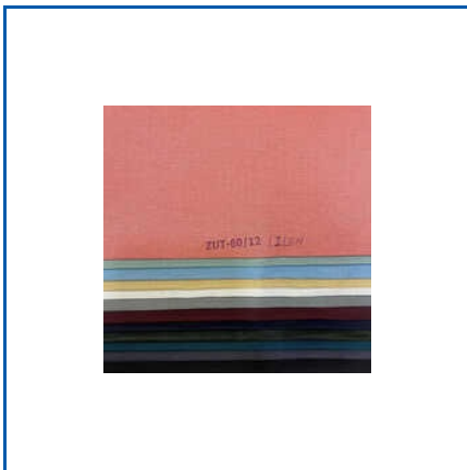
ZUT-60-12 LINEN FABRIC

155 GM 30x30 100% Cotton Twill Fabric, 20x16 Laffer Fabric, 240 GM 30x30 Gima Twill Fabric, 240 GM 30x30 Gima Twill Laffer Fabric, 250 GM 40x30 5D Calvary Twill Fabric, 265 GM 30x30 Apolo Gold Twill Fabric, 265 GM 30x30 Swan-Matrix Twill Fabric, 265 GM Cargo Twill Laffer Fabric, 2x2 Twill Alexa Fabric, 30x30 Super Cargo Twill Fabric, 3x1 7D American Twill Fabric, 40x40 58 Inch Armani Plain Satin Fabric, 40x40 Compact Vardaman Twill Fabric, 40x40 Facebook Twill Fabric, 44 Inch Poplin Lycra Fabric, etc.