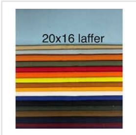
20x16 Laffer Fabric