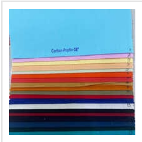
58 Inch Carban-Poplin Fabric