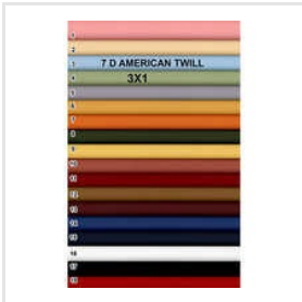
3x1 7D American Twill Fabric