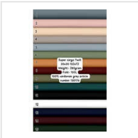
30x30 Super Cargo Twill Fabric