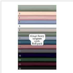
60x40 Heavy 250 GM 100L Roll Pack Fabric