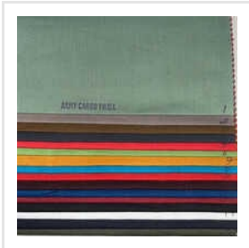
Army Cargo Twill Fabric