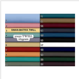
265 GM 30x30 Swan-Matrix Twill Fabric