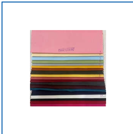
54 INCH POWER LYCRA FABRIC