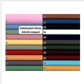
40x40 Compact Vardaman Twill Fabric