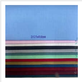
2x2 Twill Alexa Fabric