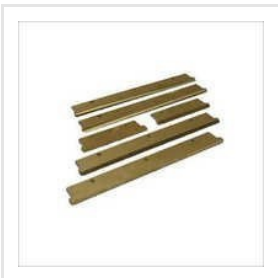
Packaging Machine Cutting Knives