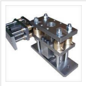
Pneumatic Euro Slot Punch