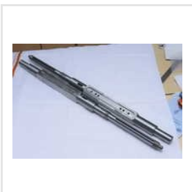
Packaging Machine Jaw Shaft