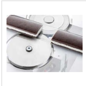
Rollnahtmodul Einseitig Gallery