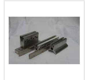
Sealing Jaw Set