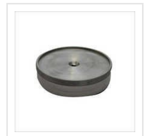
Packaging Machine Fin Wheel