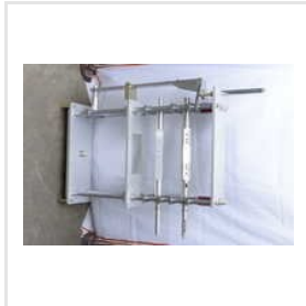
Pillar Set Assembly