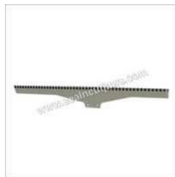
SEALING JAW BLADES