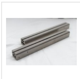
Packaging Machine Sealing Jaw