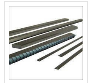
Packaging Machine Zig Zag Knives