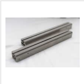
Flow Packaging Seal Jaws