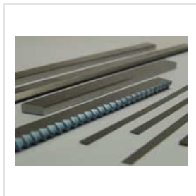
Continuous V Notch Jaw