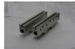
HORIZONTAL SERRATED SEALING JAW