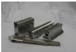
CHECKERED SERRATION SEALING JAWS

Bottom Sealing Jaws, Checkered Serration Sealing Jaws, Continuous V Notch Jaw, Corrugated Knives, Die Sets, EASY Seal Crimper, Easy Sealing Jaw, Flow Packaging Seal Jaws, Heat Sealing Jaws, High Speed Sealing Jaw, Horizontal Serrated Sealing Jaw, Knives Sealing Jaw, Packaging Machine Cutting Knives, Packaging Machine Euro Slot Punch, Packaging Machine Fin Seal Roller, etc.