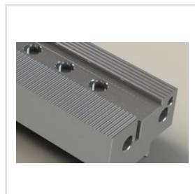
Vertical Flow Wrap Sealing Jaws