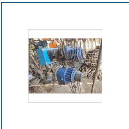
1 TON ELECTRIC CHAIN BLOCK