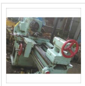
2In1 Lathe Machine