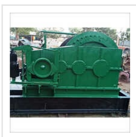
10 Ton Indian Winch