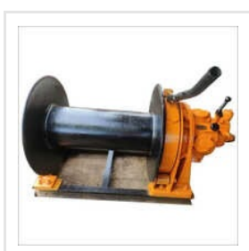
10Ton Ingersoll Rand Air Winch