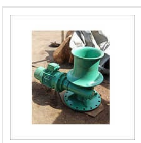
Electric Capstan Winch