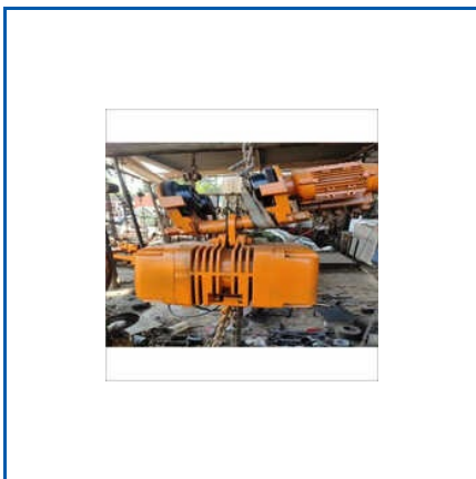
10TON ELECTRIC PULLEY CHAIN BLOCK

1 Ton Electric Chain Block, 10 Ton Electric Rope Winch, 10 Ton Indian Winch, 10Ton Electric Pulley Chain Block, 10Ton Ingrsoll Rand Air Winch, 15 Ton Electric Winch, 1Ton Motorized Electric Chain Block, 2 Ton Manual Chain Block, 2In1 Lathe Machine, 2Ton Air Winch, 3 Ton Electric Chain Block, 320 Tata Crane, 5 Ton Electric Winch, 5 Ton Electric Winch Capacity, 50 Ton Electric Winch, etc.