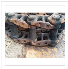
320 Tata Crane