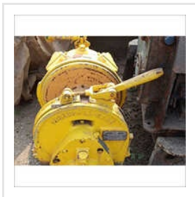
Ingesoll Rand Winch