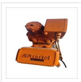
3 Ton Electric Chain Block