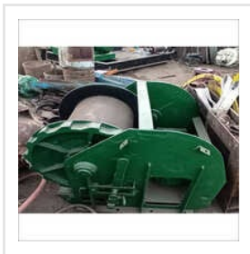
5 Ton Electric Winch Capacity