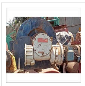
15 Ton Electric Winch