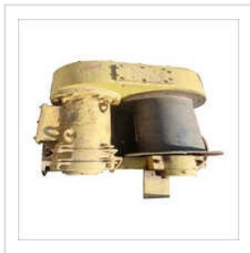
5 Ton Electric Winch