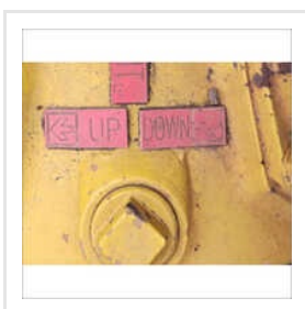
2Ton Air Winch