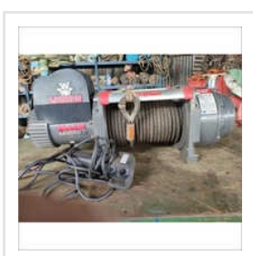
Electric Steel Rope Winch