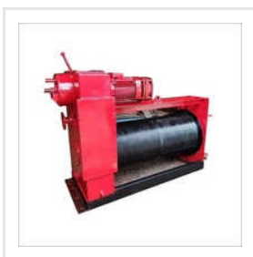
10 Ton Electric Rope Winch